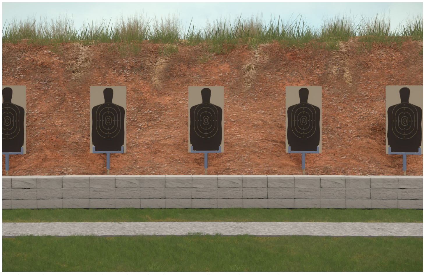
Marksmanship training and shot analysis identifies errors in shooting fundamentals