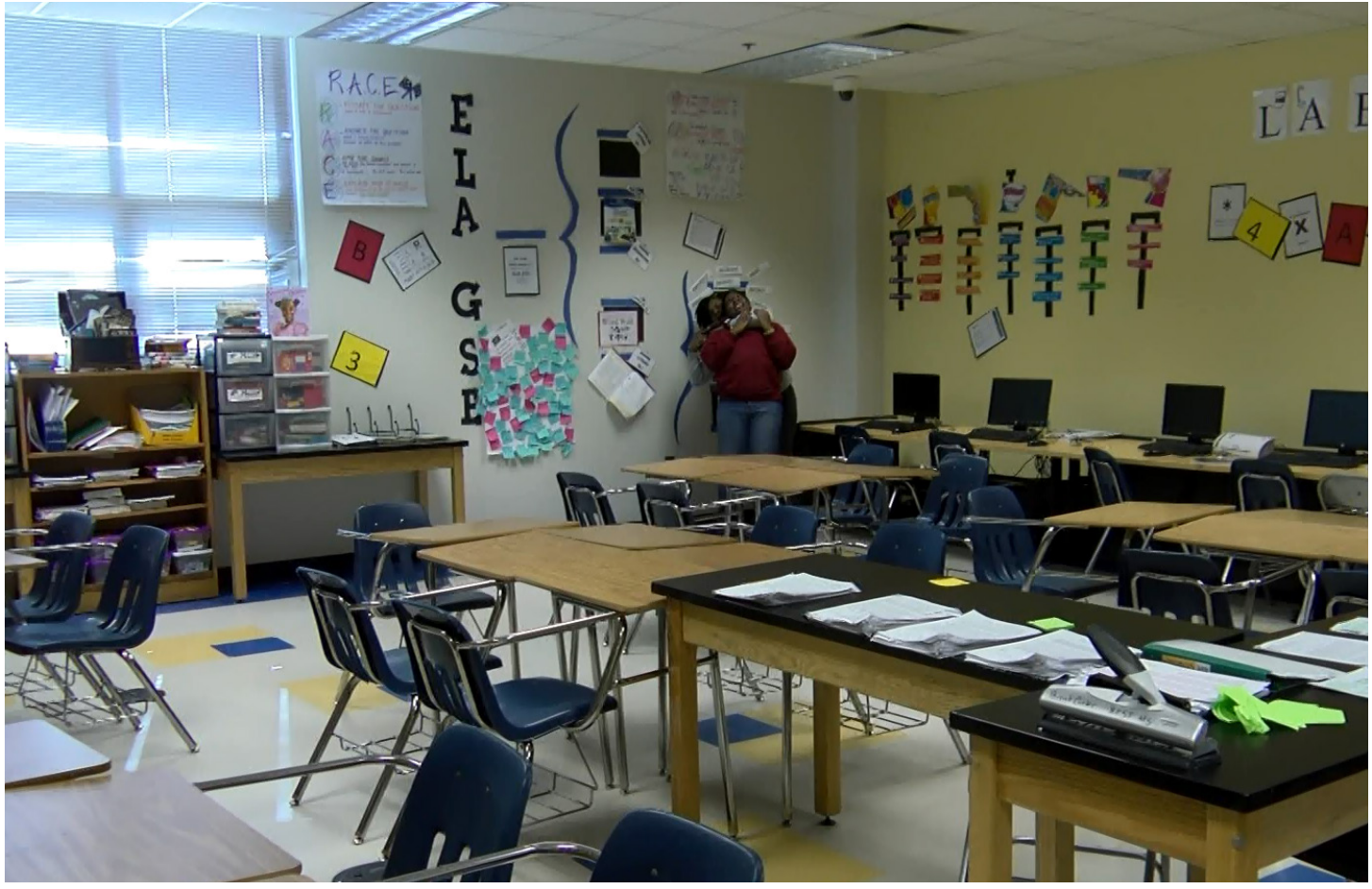
Judgmental training highlights verbal de-escalation with lethal/less-lethal force options

• Surround Sound – The self-powered audio system plays scenarios in 5.1 surround sound. Using the directional sound effects board, the instructor can add in unsettling sounds from any direction, including a barking dog, crying baby, gunshots and more to elevate situational awareness.