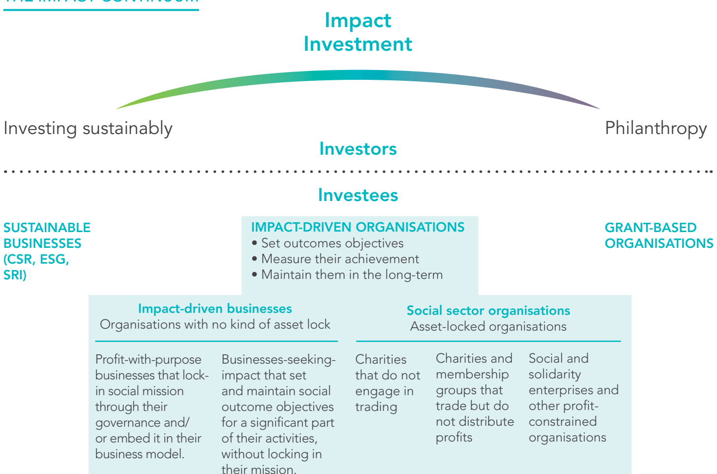
CHART C: THE IMPACT CONTINUUM

21 www.goldmansachs.com/what-we-do/investing-and-lending/urban-investments/case-studies/social-impact-bonds.html 22 www.newsroom.bankofamerica.com/press-releases/global-wealth-and-investment-management/bank-america-merrill-lynch-introduces-innovat 23 www.ubsphilanthropy.economist.com/innovations-in-philanthropy-development-impact-bonds/ 24 www.morganstanley.com/globalcitizen/investing-impact.html 25 Policy paper of the Liberal Democratic Party 2013. Available at: www.jimin.ncss.nifty.com/pdf/sen_san23/j-file-2013-06-20-3.pdf. See also National Council for Utilising Unclaimed Assets: www.kyumin.jp/media/pickup/