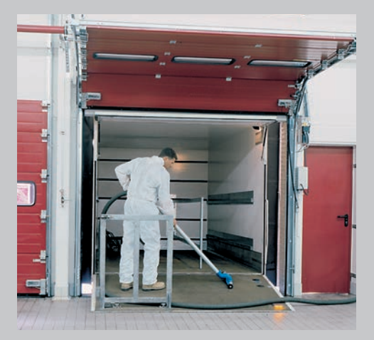
Delivery trucks are easily and hygienically cleaned after their return from the delivery tour.