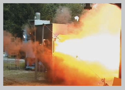
Possible effect of a dust explosion