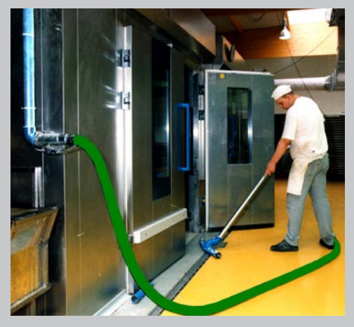
Cleaning of baking equipment with a stationary vacuum system

A highly efficient pocket filter and a cyclonic separator retain even the finest flour particles. Depending on your requirements, units with dust class M or H are available.