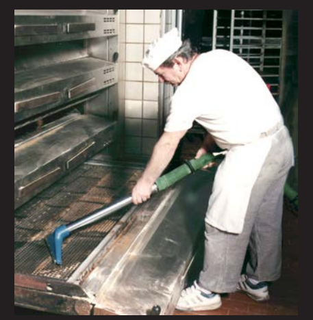
Extraction of baking residuals with an IS-36 industrial vacuum cleaner