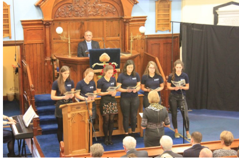
Members of SEFF's Youth Choir