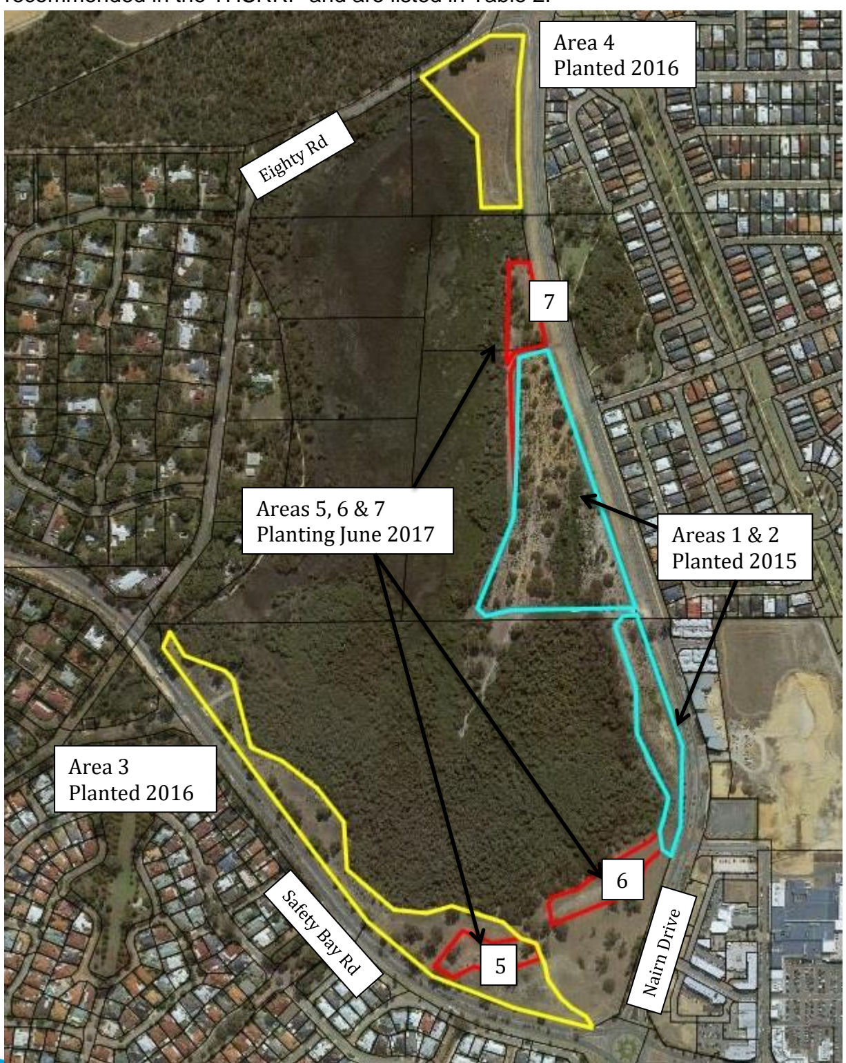
Figure 1: Revegetation Zones - Tamworth Swamp

Figure 1 below illustrates areas of revegetation at Tamworth Hill Swamp. Species used in revegetation are plants known to be primary feeding plants for Black Cockatoos or recommended in the THSRRP and are listed in Table 2.