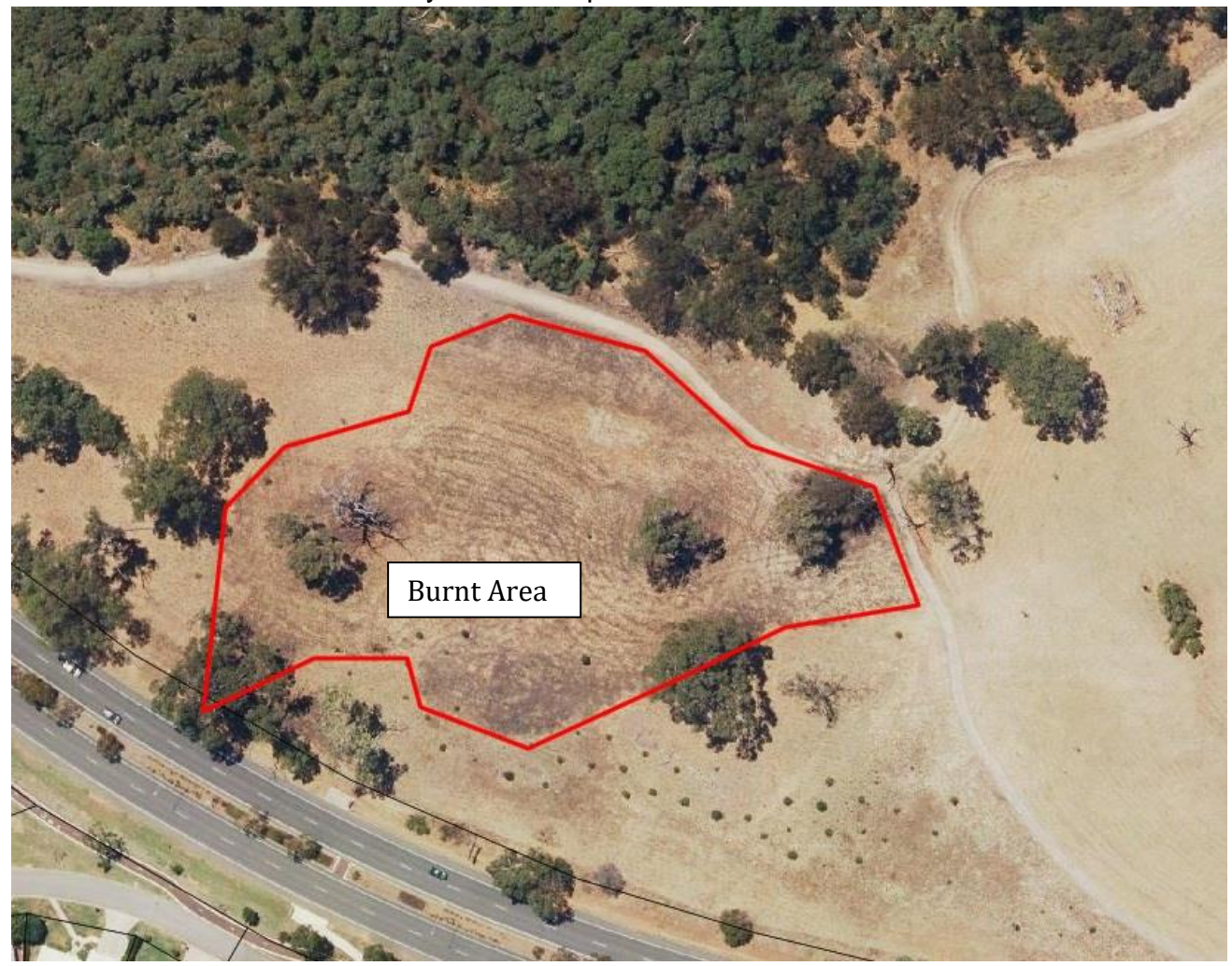
Figure 2: Burnt area – 800m<sup>2</sup>

Revegetated areas have now reached capacity. Areas will be monitored and replanted as needed to accommodate for any attrition in plants.