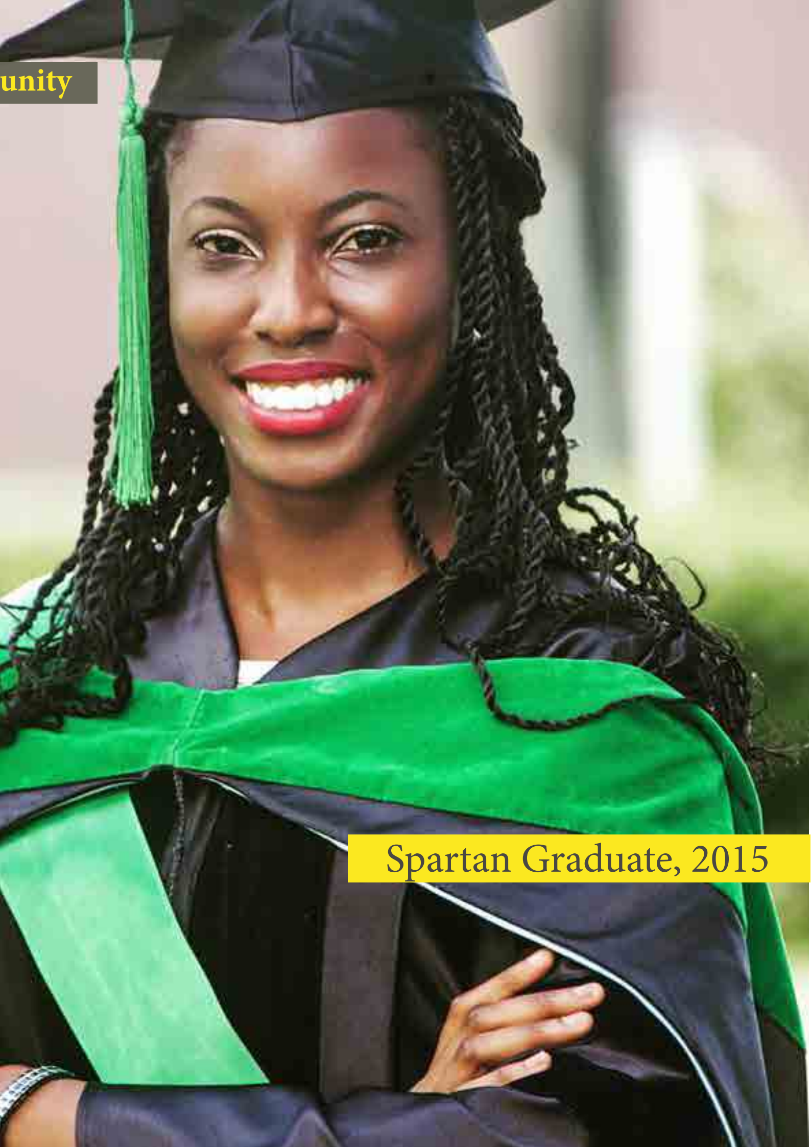
Spartan Graduate, 2015