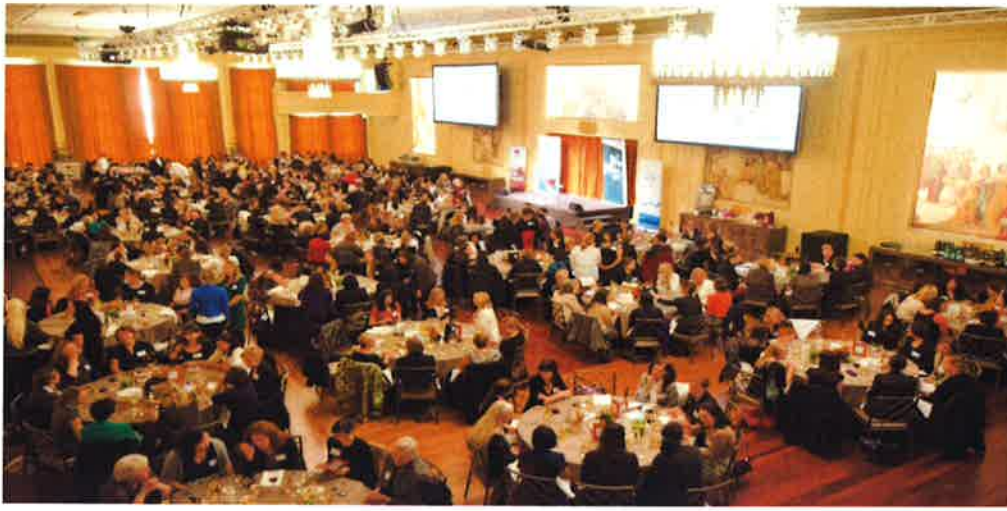
The Network's 2012 "Connecting Women in Biotechnology Luncheon", Mural Hall.