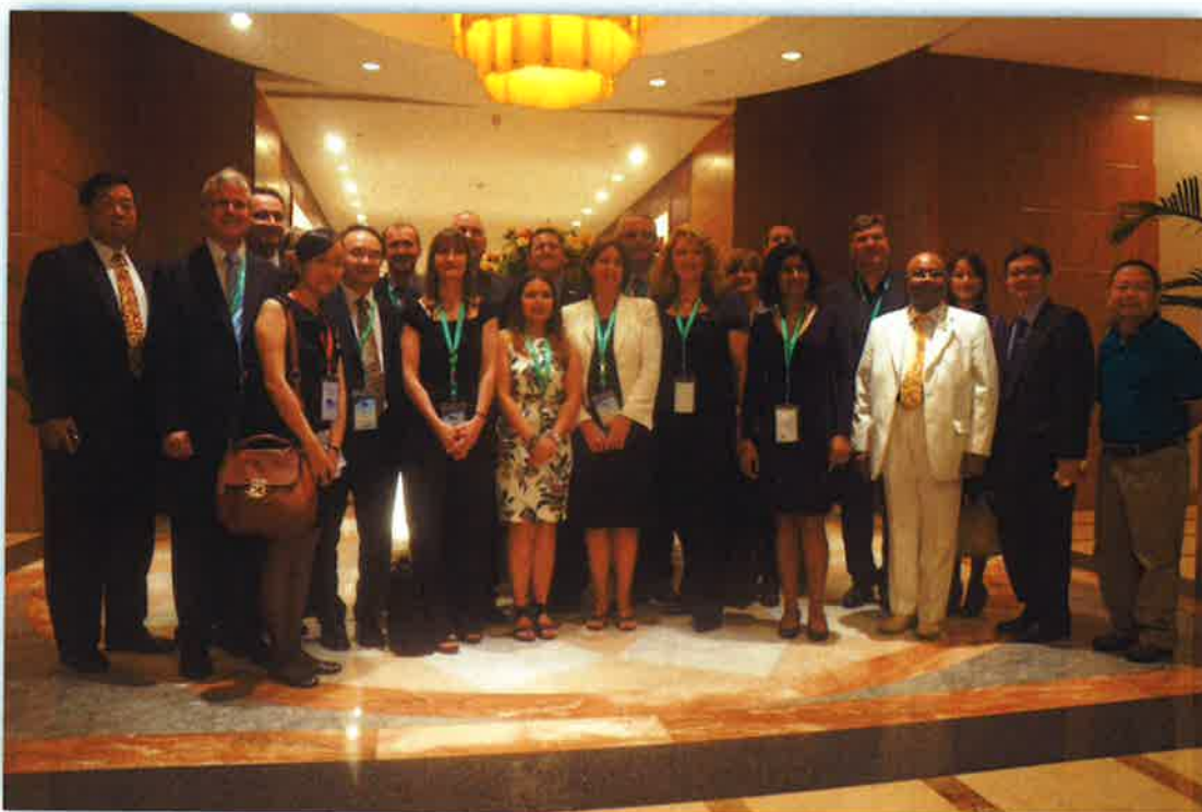
Premier's Super Mission to China September 2012 – The Victorian life Sciences Delegation