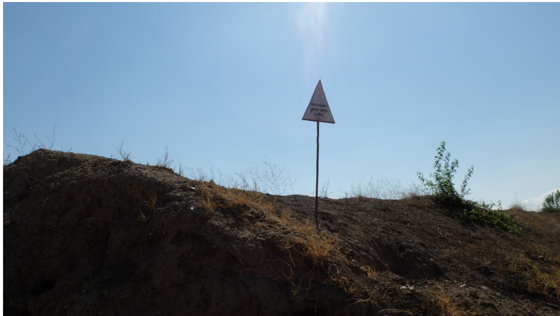
The point just before the Azerbaijani front line