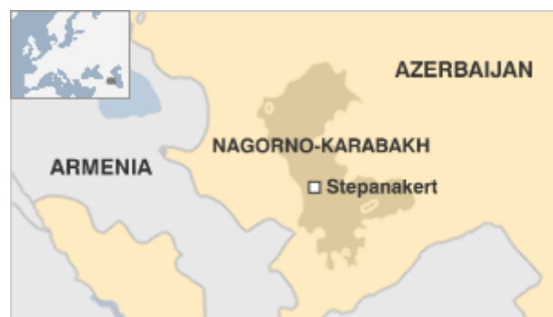
BBC Map of Nagorno-Karabakh

In April 2016 Nagorno-Karabakh experienced its worst clashes for decades with the 1994 ceasefire breaking down between Azeri and ethnic Armenian forces. The conflict resulted in an alleged death toll of 200 (soldiers and civilians). 9 Tensions reached boiling point, with Azerbaijan threatening a major scale attack on the country's capital Stepanakert – which is home to some 50,000 people - until eventually after nearly four days of fighting a ceasefire was agreed upon by both sides. 10 However, tensions still remain high in the disputed region with success yet to be achieved in the ongoing peace negotiations.