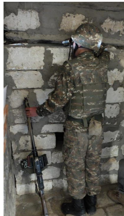
A soldier looking out on the Azerbaijani front line

We met with a number of individuals to discuss these issues and were left with the impression that there is an increased awareness in the military capacities of Azerbaijan. We believe this, coupled with the clear and present continued feeling of isolation from the international community, has fostered a readiness for war. It could be said however that the recent events have also promoted a greater sense of identity and a strengthening of civil society as the conflict forced people together. Those we spoke to also seemed largely unconcerned with the loss of territory, stating the land lost was not of strategic importance. Encouragingly, in spite of the recent spike in hostilities the Minsk Process is still seen largely as the only way forward to resolution. However, there is of course considerable frustration at the slow process of this.