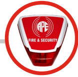
External Sounders An audible and visual deterrent