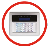
Keypads For multiple entry points