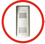
External Detectors Protecting the perimeter