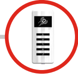
Prox Tag Reader Set/unset from a tag on your key-chain