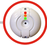
Break Glass Sensor Protecting windows from intrusion