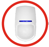
Internal Detectors A wide range of detectors available: including grade 3 & pet detection