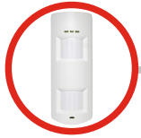
TMD Grade 3 dual technology internal detector

Wired Peripherals Available for Your Home