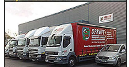
The company provides bonded warehousing & distribution, road haulage and transport & handling service in Ireland