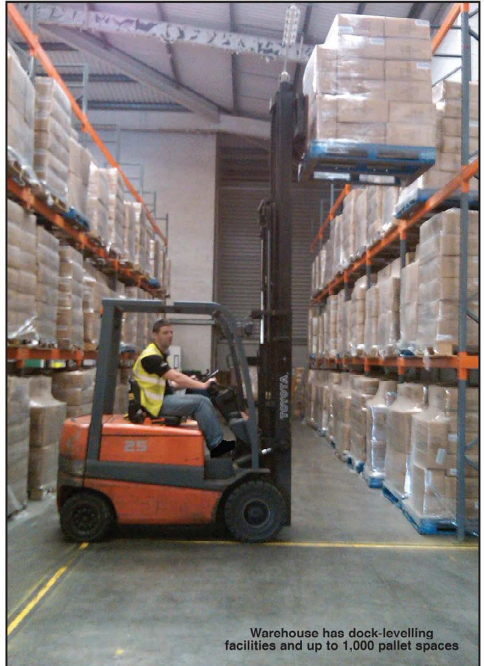
Warehouse has dock-levelling facilities and up to 1,000 pallet spaces

Spratt Transport Services Unit C1, Furry Park Industrial Estate, Santry, Dublin 9, Ireland. Telephone: 01 8527100 Fax: 01 8527102 email: sales@sprattrans.com www.sprattrans.com