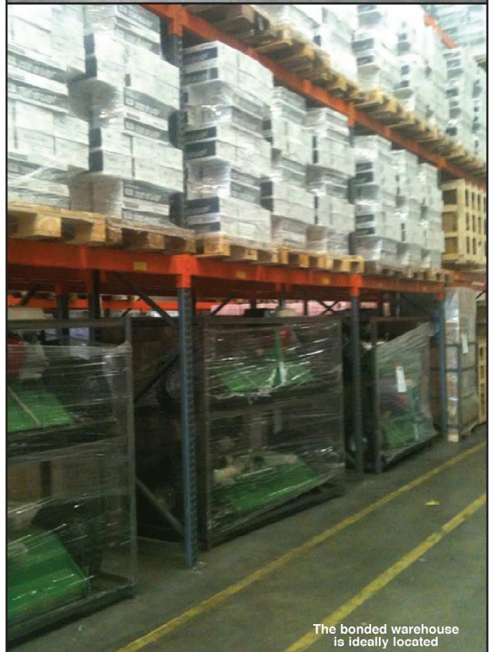
The bonded warehouse is ideally located