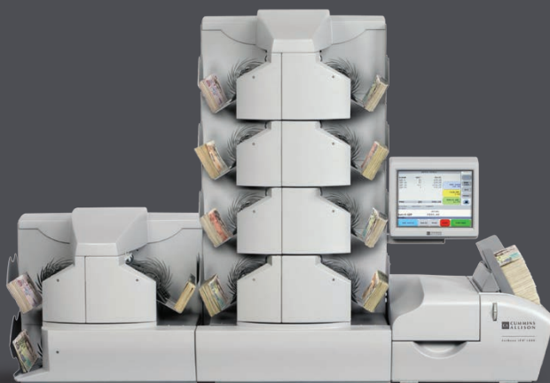
11 pocket horizontal that can be upgraded.

Even if you process moderate amounts of currency, you now can affordably gain the high speed and productivity of a multi-pocket sorter – in a small space.