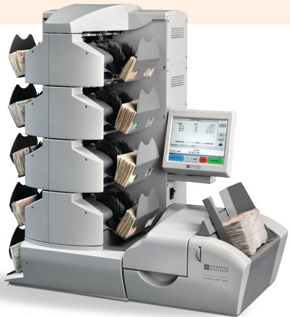
Compact 9 pocket vertical.