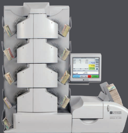
Expand to 9 pockets vertically...

Navigating to frequently used count and sort operations takes less time and effort. For even greater functionality, choose the One Touch Plus operating software to create multiple processing types, enter coin and non-cash items into batch totals, and accommodate future processing features.