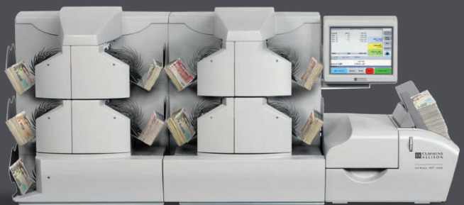
...or 9 pockets horizontally.