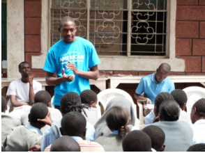
A visit to Brainhouse of a successful entrepreneur inspiring the current students.

We are currently planning a very ambitious and exciting project, to build a Vocational College and Business Centre for the young people leaving Brainhouse Academy.