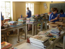
Sorting the delivery of books for the Library

In October we were able to fulfil a dream of one of our students by starting a library at Brainhouse.