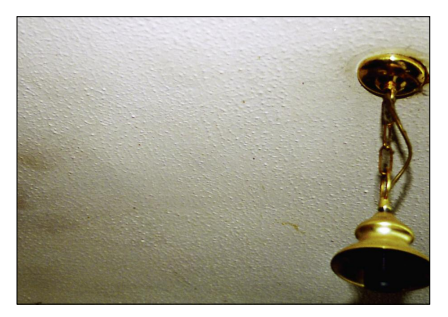
Textured coating on a ceiling