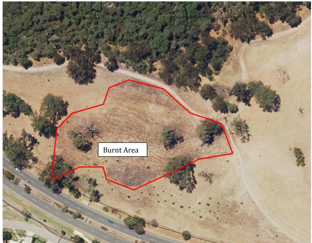
Figure 2: Burnt area – 800m<sup>2</sup>

In winter 2015, the City revegetated 10.4 hectares with 30,000 plants (Areas 1 and 2 as indicated in blue). A further seven hectares were revegetated with 27,000 plants in winter 2016 (Areas 3 and 4 indicated in yellow on Figure 1). During winter 2017, 15,000 plants are scheduled to be planted throughout three hectares of degraded area (indicated in Figure 1 by red). The 2017 revegetation will include new revegetation zones (Area 6 and 7), infill planting throughout existing zones and replacement of plants lost during a fire in late 2016 that burnt through an estimated 800m<sup>2</sup> area near Safety Bay Road (Area 5).