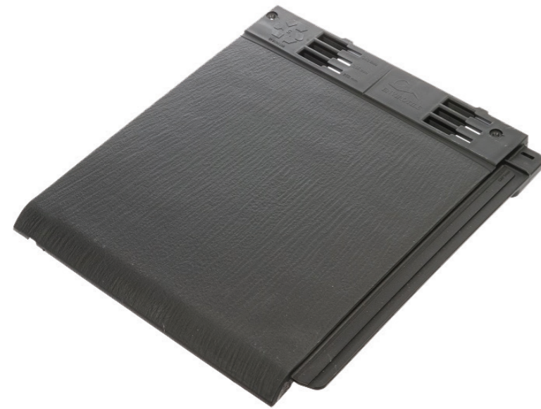
Anthracite Black ▲