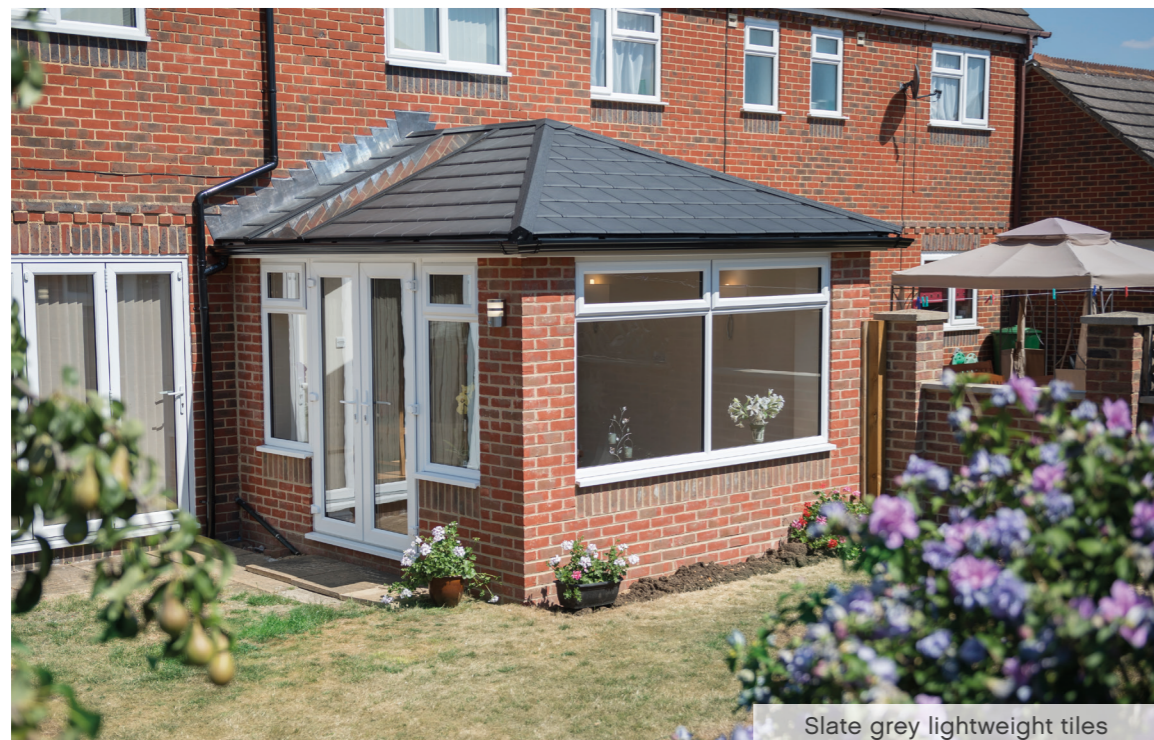
Slate grey lightweight tiles