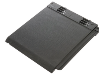
Slate Grey ▲