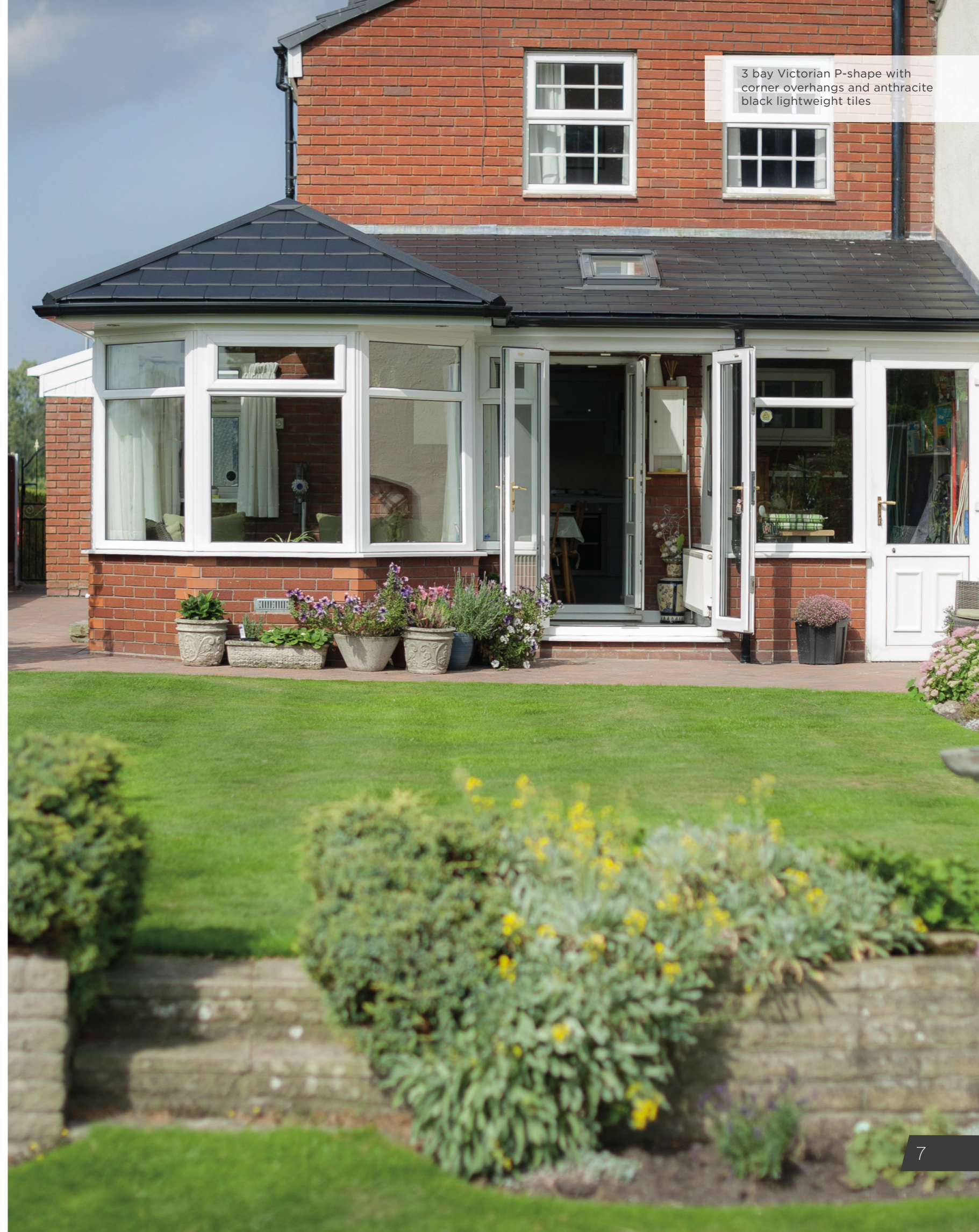
3 bay Victorian P-shape with corner overhangs and anthracite black lightweight tiles

Whether it's a new addition to your home or part of a conservatory refurbishment, the WARMroof is designed to incorporate the features of the main house in terms of brickwork, roof tile colour and even roofing pitch, much like a traditional extension. The choice of two stock tiles including a slate effect tile come with either a 25 or 40 year warranty giving you complete peace of mind. WARMroof is also structurally proven to accommodate traditional slate or concrete tiles to match your home. You may also want to consider the latest bi-folding doors and Velux roof-lights into the overall design, for added flexibility.