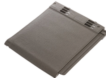
Dark Brown ▲

Request to see samples swatches of our tiles & colours. ▶