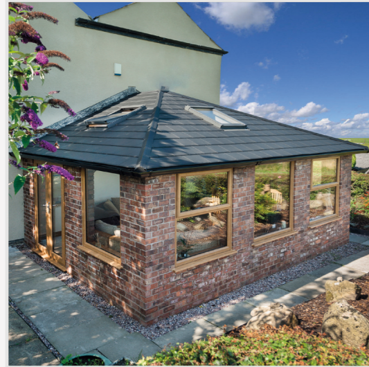
GEORGIAN or EDWARDIAN

The WARMroof is designed to accommodate all existing conservatory roof styles as these are more complex than typical traditional extension roofs. Therefore, to date, we haven't had a roof design that is beyond the scope of the roof's capabilities. No matter what shape or style of conservatory you have, there is a WARMroof for you. Below are some examples of WARMroof installations on various styles of conservatory or home extension.