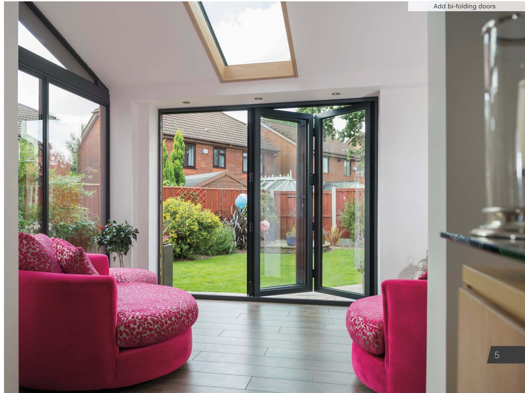
Add bi-folding doors