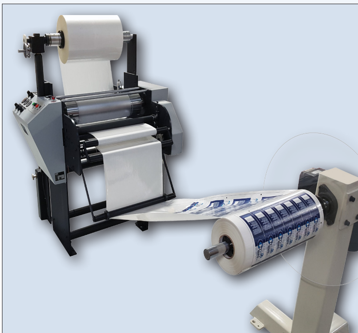
System 2760 With Roll Media Unwind