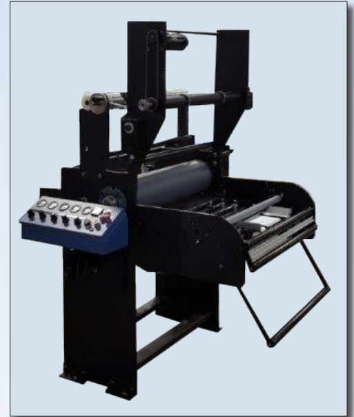
System 3210 With PSA & Inline Feed Option