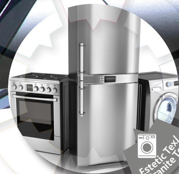
Estetic Tex Granite Tex