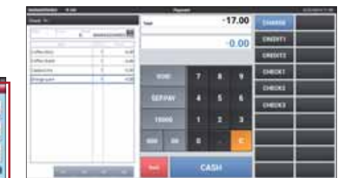
Support panel display examples