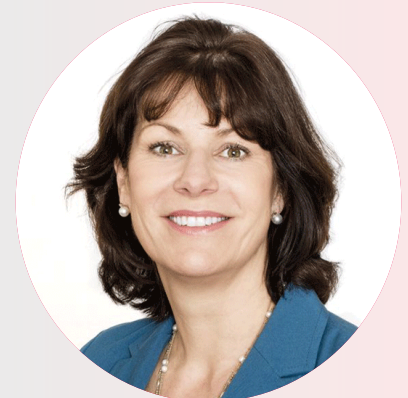
The Rt Hon Claire Perry MP Minister of State for Energy and Clean Growth

On 12 June 2017 Claire was appointed Minister of State for Energy and Clean Growth at the Department for Business, Energy and Industrial Strategy. Since her arrival, she has led the delivery of the Government's inaugural Clean Growth Strategy, established the Green Finance Taskforce, and launched the Powering Past Coal Alliance, a global initiative to drive the transition to cleaner energy. Claire attends Cabinet and was made a member of the Queen's Privy Council in March 2018. Claire holds a degree in Geography from Brasenose College, Oxford and an MBA from Harvard Business School.