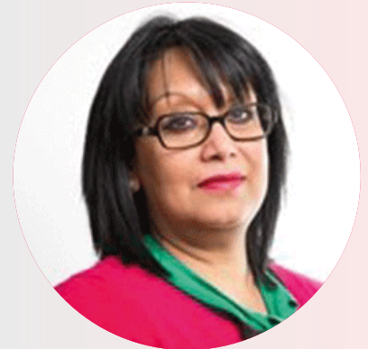
Baroness Verma Co-founder and Board Member POWERful Women

Between 2010 and 2016 her posts included the position of Parliamentary Under-Secretary (Department for International Development), Parliamentary Under-Secretary (Department of Energy and Climate Change), Lords Spokesperson (Department of Business, Innovation and Skills), Lords Spokesperson (Home Office) (Equalities and Women's Issues), Baroness in Waiting (HM Household) (Whip), Lords Spokesperson (Department for International Development) in government.