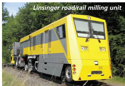
Linsinger road/rail milling unit