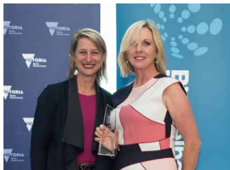
Women in Leadership Award – recognising senior corporate leadership and directorship