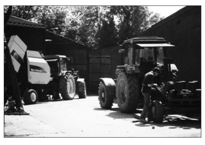
Maintaining equipment is vital for Duncan's business - a broken machine means delays for farmers and loss of earnings for Duncan.

Haylage is slightly wetter than hay and needs to be wrapped to prevent mould growing on it and to preserve the nutrients in the grass. Silage is the wettest form of mowed grass and can be wrapped like haylage or put in a silage pit covered by plastic but must be kept airtight to enable fermentation so that bacteria can create a natural preservative and vitamins such as folic acid and vitamin B12.