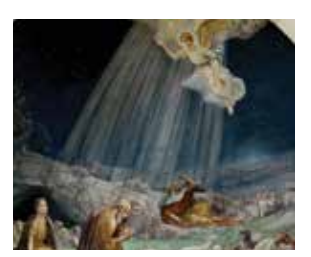
3 The angel appears to the shepherds