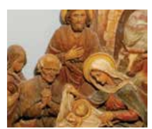
2 Jesus is born