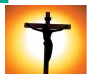
Jesus dies on the Cross