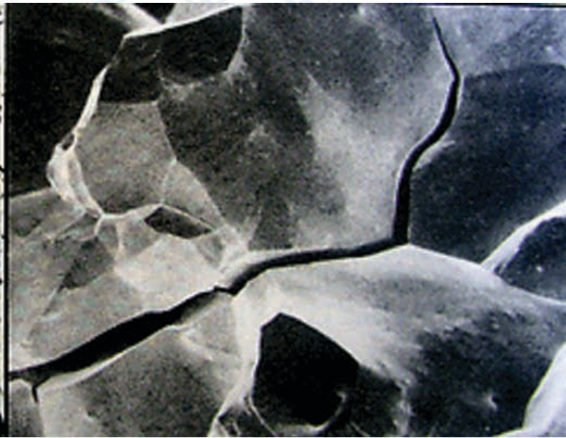
An electron micrograph of a “clean” silver soldered joint. Note the crack lines and other impurities of the melted metal.