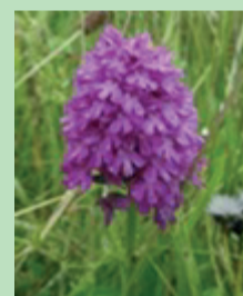
Pyramidal orchid ( Anacamptis pyramidalis )