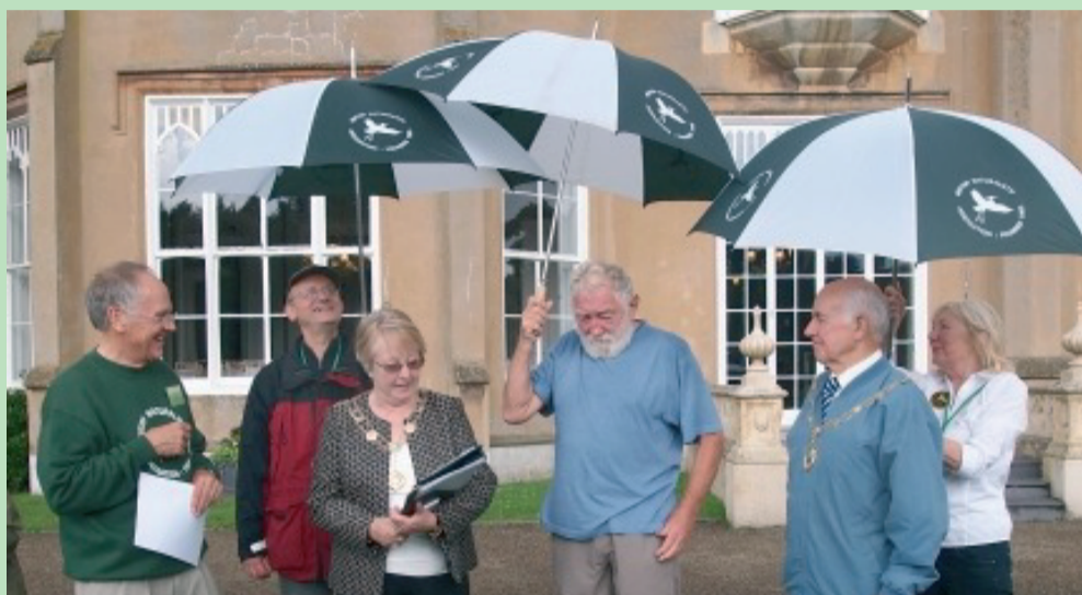
David Bellamy with the Deputy Mayors of the Boroughs of Sutton and Epsom & Ewell

The 2012 meeting was held at Nonsuch Park, Surrey. The weather was a touch unkind, particularly at the greeting ceremony outside Nonsuch Mansion. David Bellamy, Deputy Mayors of the Boroughs of Sutton and Epsom & Ewell together with early attendees lined up for photographs just in time for an incredible downpour but BNA umbrellas came into their own and our guests were kept dry.