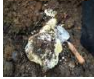
primary source material.

Chromate salts were very patchily distributed in shallow soil, in high density particles ranging in size from boulders to single crystals. Leached secondary deposits, invisible to the eye, were often found to be present in soil below the