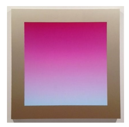
Rob Pruitt, Suicide Painting