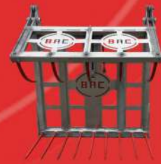
Special 1 Off Designs