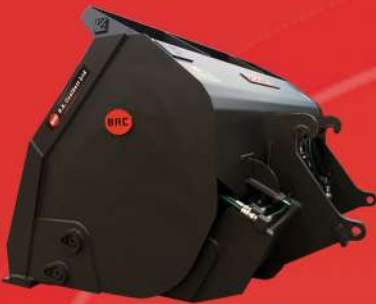
High Tip Buckets