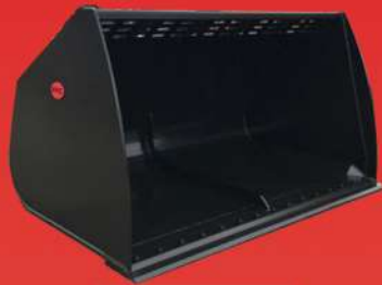
General Purpose Buckets