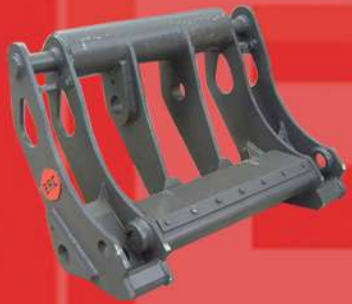
Quick Hitch Brackets