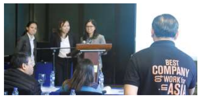
Minimum Prudential Liquidity Requirements