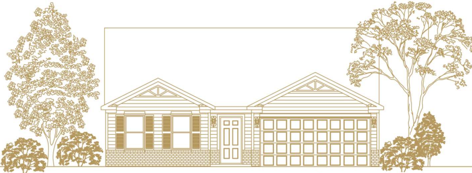
Elevation Scheme 1