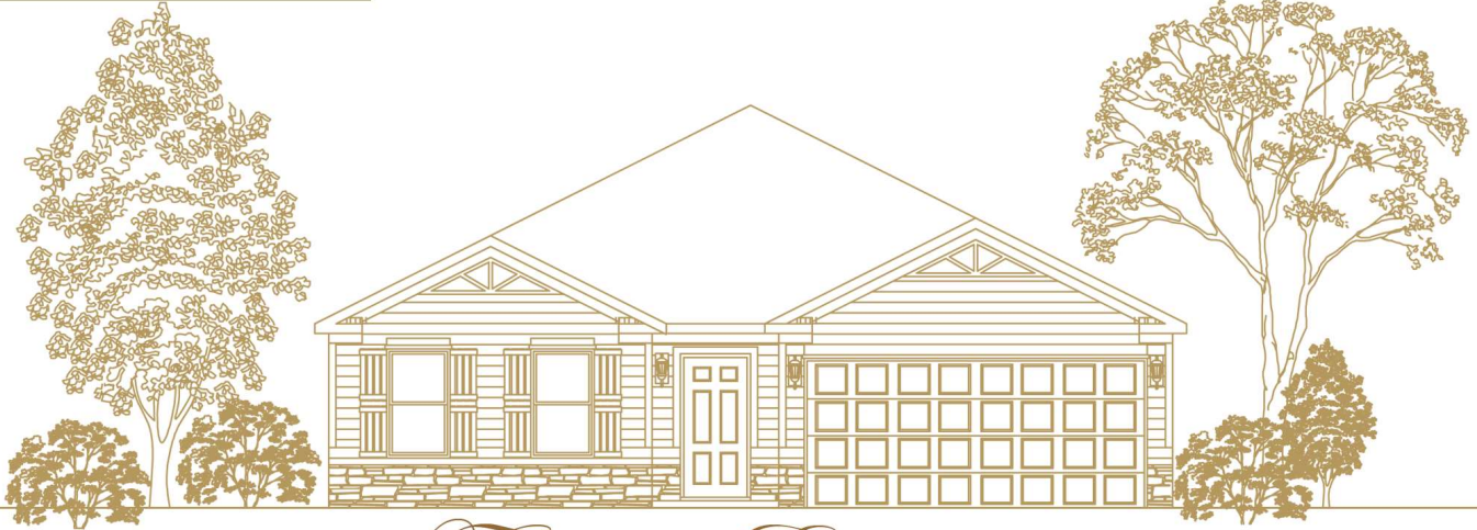
Featured Elevation Elevation Scheme 3