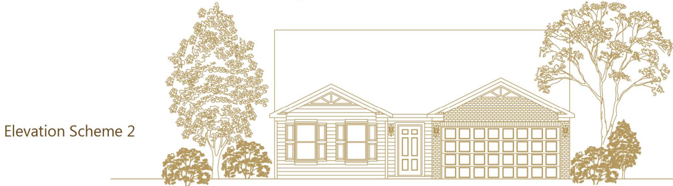
Elevation Scheme 2