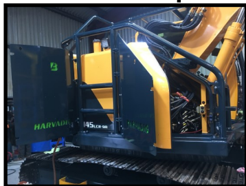
Hinged lockable steel protection doors for easy access for maintenance