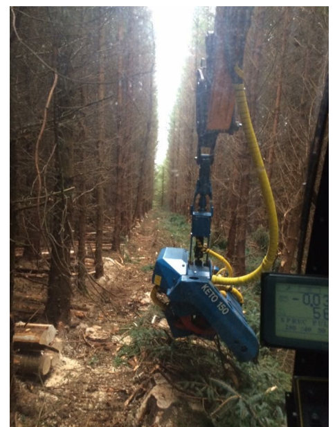
Zero tail swing perfect for thinning