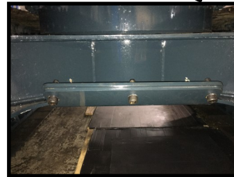
Heavy duty under belly guards