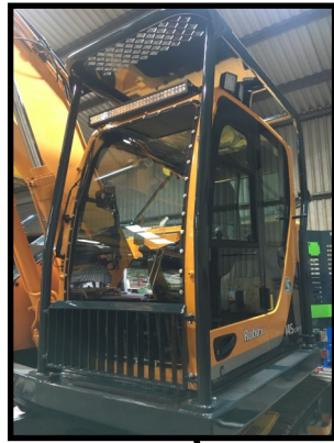
Marguard window c/w part or full front and top guard. Extra working lights