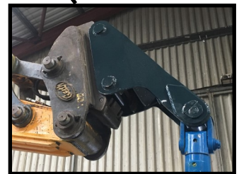
Standard quick hitch mount