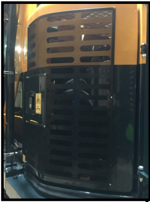
Mesh protected vents