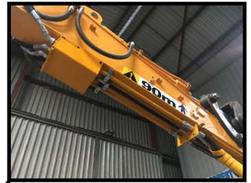
Harvadig quick release hose system. Change between attachments in just 5 minutes