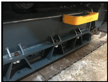
Heavy duty full length track guides