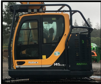
Heavy duty but light- weight frame