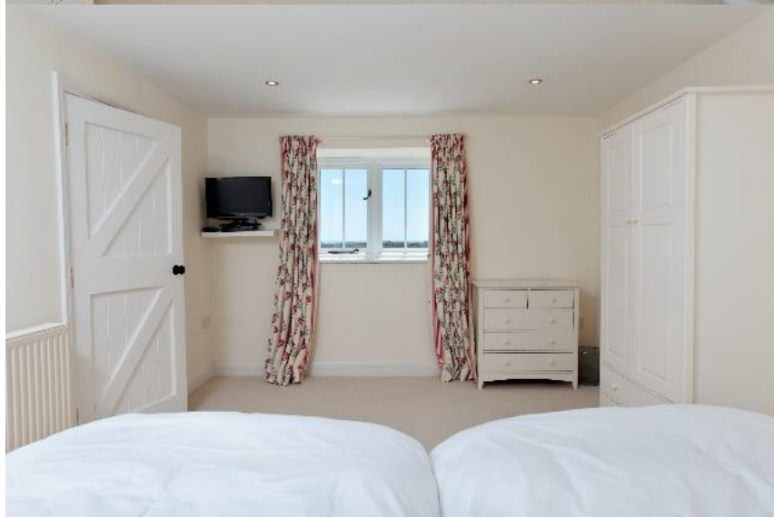
Accessible Twin/King Bedroom