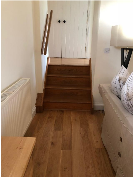
Steps from Living Area to Bedrooms