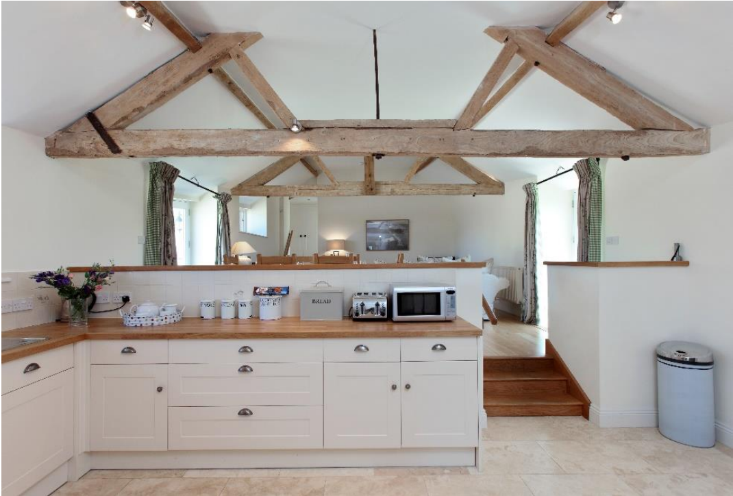
Kitchen Steps to Living Room