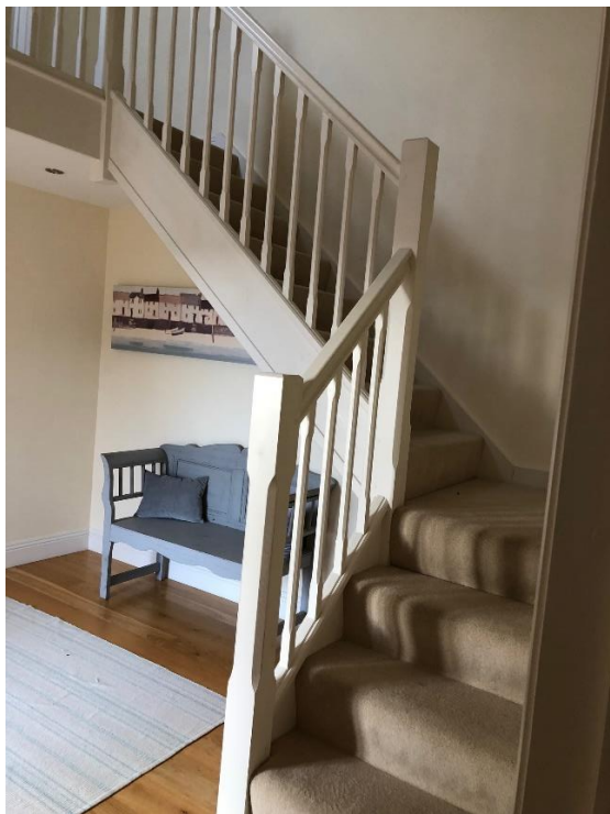
Steps to First Floor