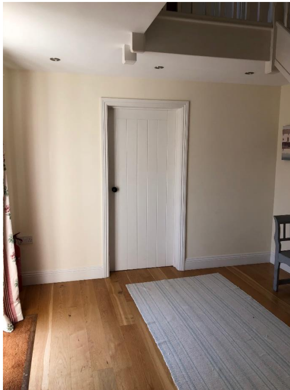
Colour Contrasting Walls and Doors