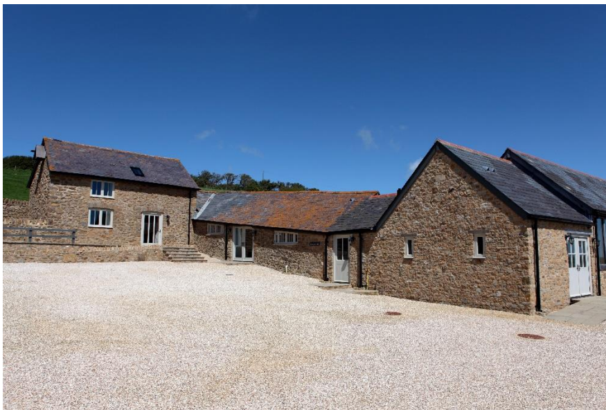
Parking at Clayhanger Lodge