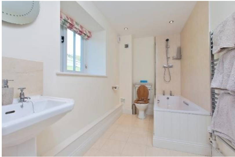
Accessible Twin/King Ensuite