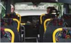
Above: Inside the Iveco minibus.