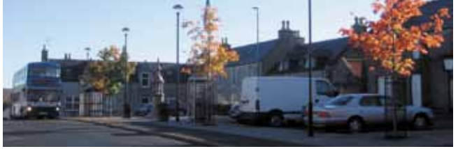
The Square is looking good since its enhancement in 2010.

The Community Pavilion in McRobert Park continues