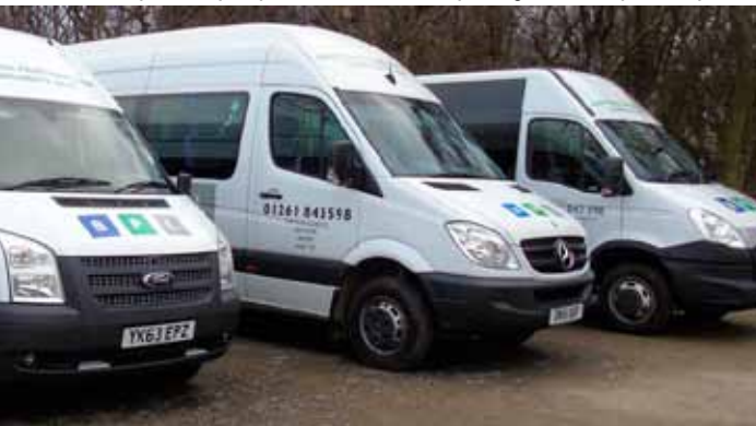
Left: Our current fleet of minibuses.

If you would like to find out more or register your group, please call us on 01261 843598. We'd be delighted to give you more information.