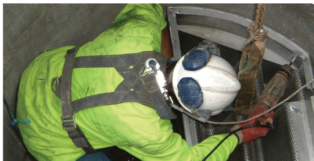
Retro-fit installation of screen.

The Cross Wave Copacurve™ is typically installed horizontally at 90 degrees to the overflow weir, with upward flow through the screen. The unique curved wave shape of the screen and the electro-polished screening surface aid the drop off of screening material as the water level within the chamber falls.