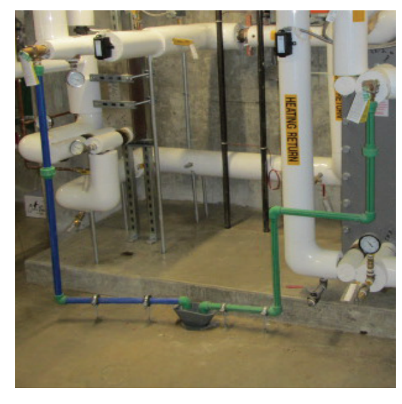
Aquatherm pipe in place at UBC's Totem Infill student residence hall.

"The water in the metro Vancouver area can be quite aggressive," he said. "It's acidic and it likes to eat metal, so copper pipe won't last as long as the life expectancy of Aquatherm pipe systems. If you have a building that's 10 or 15 years old and has copper piping, the likelihood is that you're going to start getting leaks, which can be costly. When that occurs Aquatherm has become the choice for re-piping."