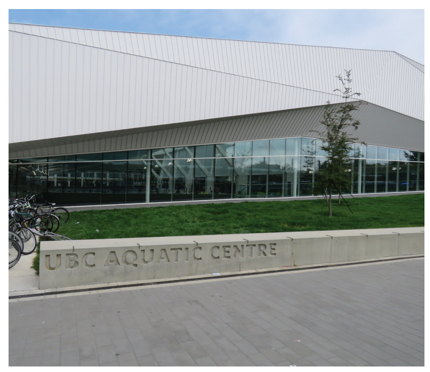
UBC's new Aquatic Centre is one of many buildings on the UBC campus that use Aquatherm.