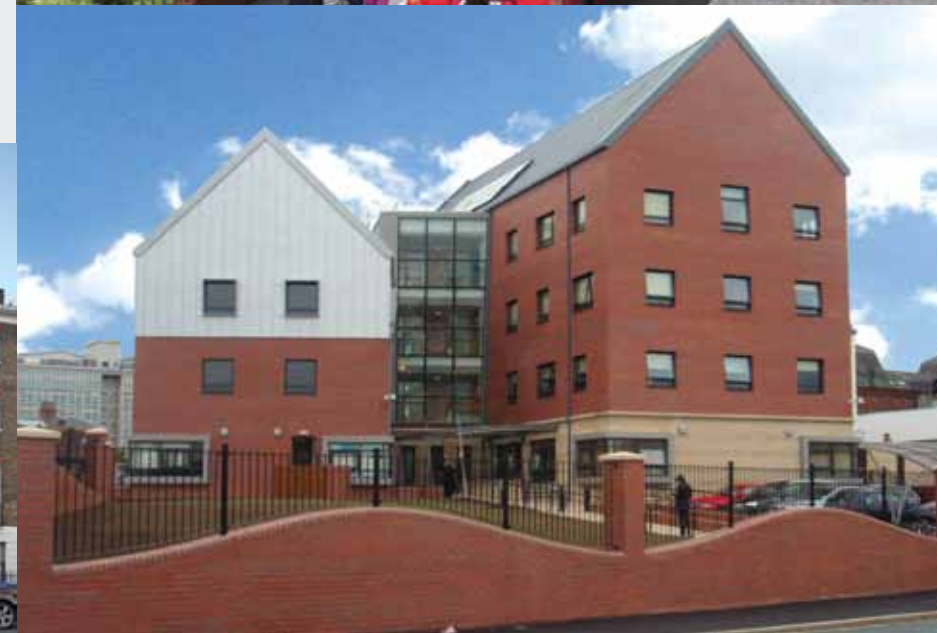
Below right: Marsh Farm Client: Marsh Farm Community Development Trust Works: We provided monitoring inspections and audits during a new community project providing community facilities and services, community healthcare accommodation, business enterprise hub, retail outlet and indoor playground.