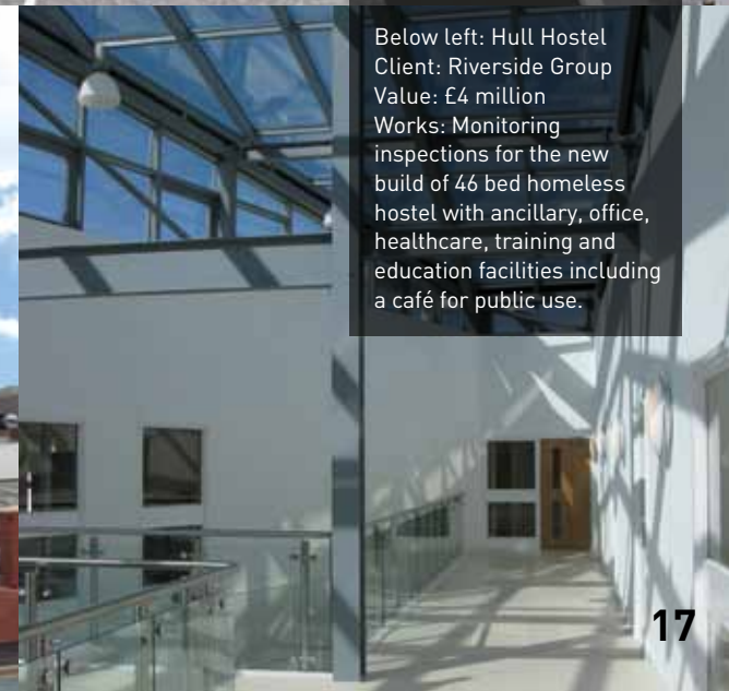
Below left: Hull Hostel Client: Riverside Group Value: £4 million Works: Monitoring inspections for the new build of 46 bed homeless hostel with ancillary, office, healthcare, training and education facilities including a café for public use.