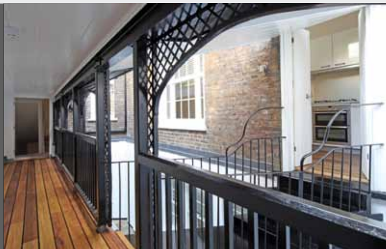
32 Manchester Street Client: The Portman Estate Works: We carried out monitoring inspections throughout the major improvement works of this Grade II listed property.