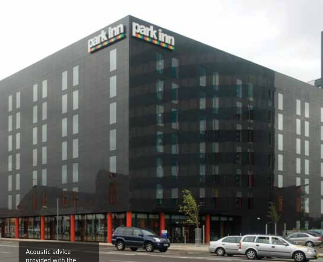
Acoustic advice provided with the design and build of a Manchester hotel.