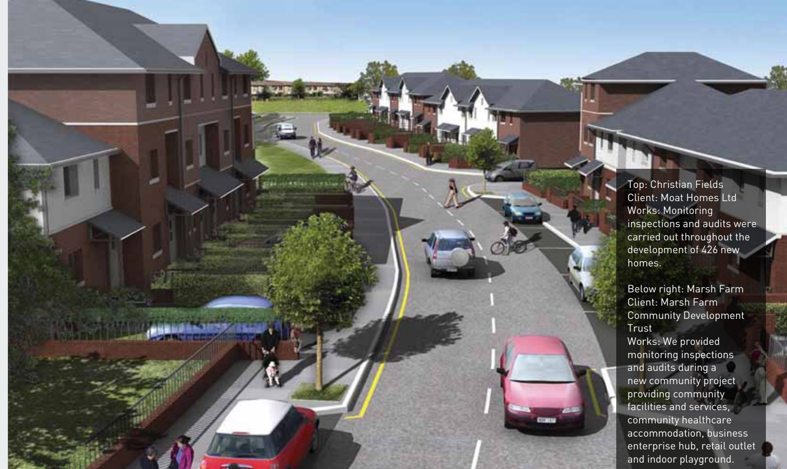
Top: Christian Fields Client: Moat Homes Ltd Works: Monitoring inspections and audits were carried out throughout the development of 426 new homes.