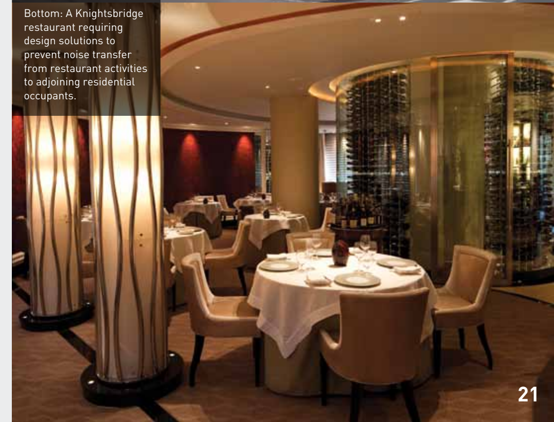
Bottom: A Knightsbridge restaurant requiring design solutions to prevent noise transfer from restaurant activities to adjoining residential occupants.