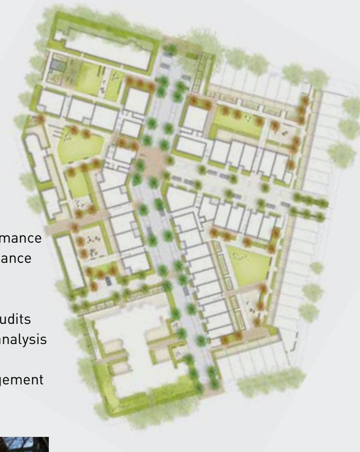
Above: Plaistow Hospital Works: Site waste management plan carried out in connection with the new build of 200 units and conversion of existing buildings.