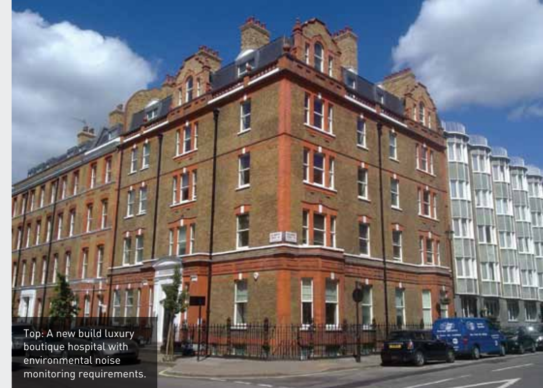
Top: A new build luxury boutique hospital with environmental noise monitoring requirements.