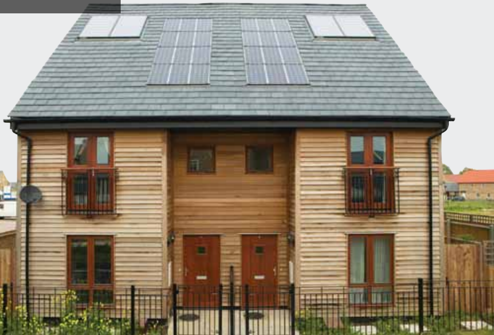
Cambourne Village Client: Circle Anglia Works: Environmental management services in connection with the design and construction of 21 houses and 10 flats.