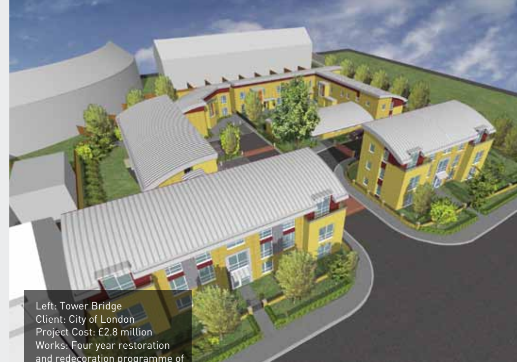
Left: Tower Bridge Client: City of London Project Cost: £2.8 million Works: Four year restoration and redecoration programme of iconic bridge.