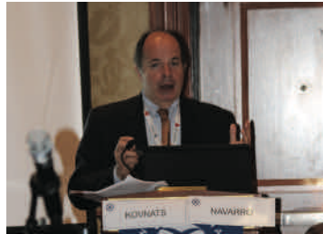
Don't delay TPP

Looming large in the American, and global, consciousness is the 2007/8 global financial crisis, which demonstrated how quickly conditions in one sector can flow throughout the US and, from there, to the rest of world. The answer to that disaster has, however, been a recovery in global trade. By 2010-11, the strength of World Trade