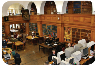
Canterbury Cathedral Trust Fund. Registered Charity in England and Wales: 1112590. Charitable Company Limited by Guarantee: 5588837. Correct at time of printing, December 2015.