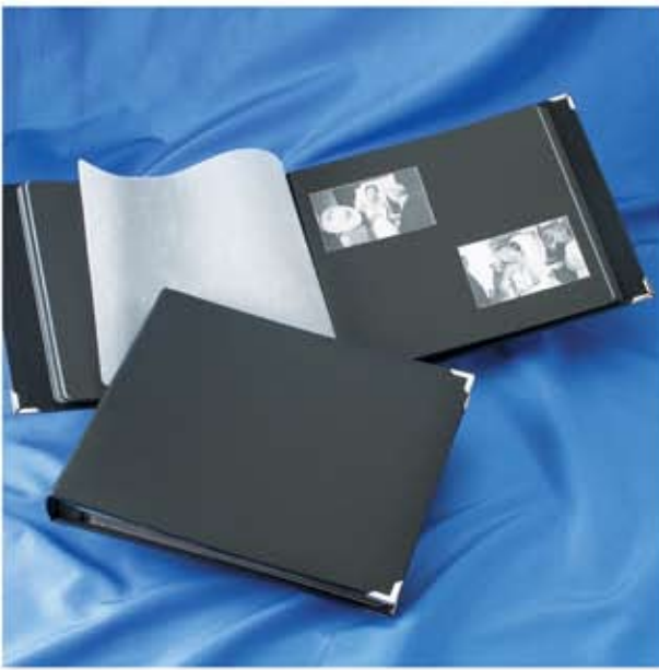
Digital / Reportage style albums