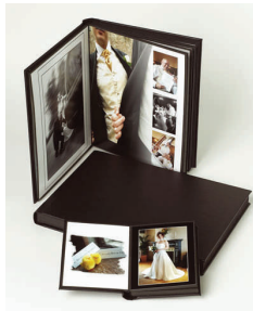
Image books / magazine style albums

A cheaper alternative to the Expressions album, but retaining the contemporary magazine / coffee table style feel. Full page prints of either complete photographs in colour or B&W or alternatively each print can be a montage of photographs. Presented in a stylish hard-back album with a wide range of covers including leather, metal, wood and acrylic. Smaller 7"x5" or 5"x4" second albums available.