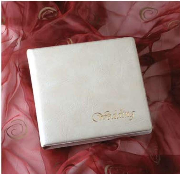
Massive range of traditional style albums