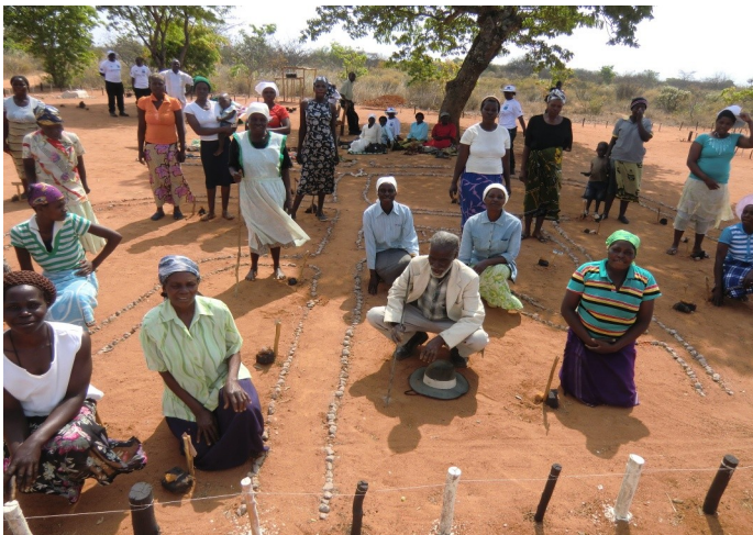
Positive Peer pressure. At each CHC venue, the member draw a large map on the ground and mark their homes and sanitation facilities, which enable them to plan their latrine building as a group. This has resulted in 7771 latrine built in one year without subsidy.

Other club members mentioned they will continue to meet, but will tackle other projects and income generating activities. Members described excitement within the club at having a forum to discuss issues in the village. Across clubs, such issues and activities likely to be discussed in the future include orphans and vulnerable children, income generating projects to raise funds to build toilets, replacement materials for pot racks and temporary latrines (rather than destroying vegetation to build structures that will eventually decay), molding bricks to erect permanent latrines, advocating for the construction of boreholes, and visiting homesteads to make sure hygienic practices are being implemented.