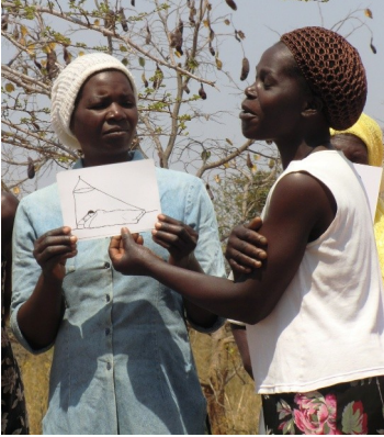
Through interpreting pictures women learn to express their ideas about health issues in public.

Project Title: Cholera Mitigation through Community Health Clubs Objective: Community Capacity and Resilience Building to WASH related diseases