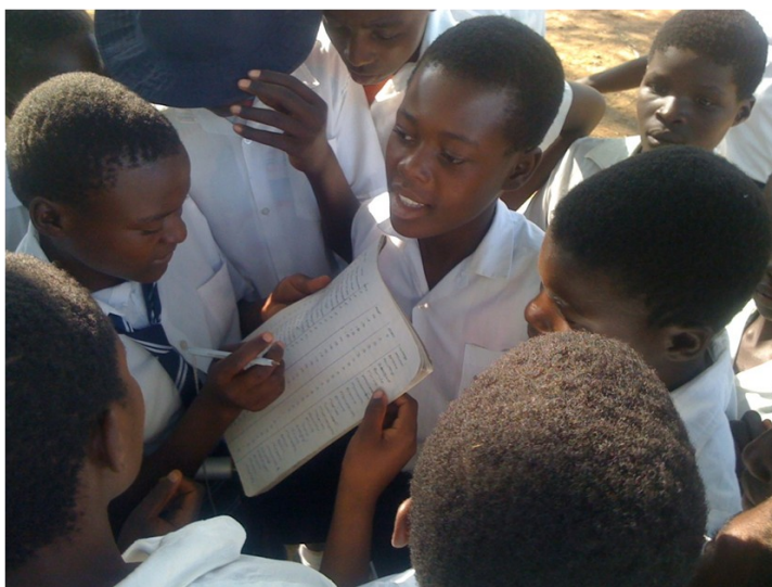
School Health Club conducting a survey of their school