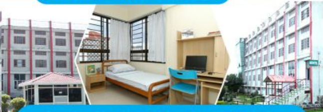
Separate Hostel for Boys & Girls