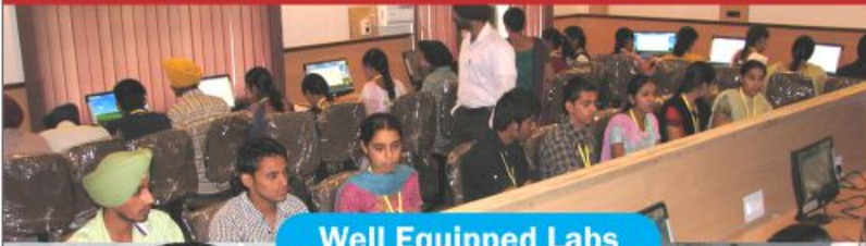
Well Equipped Labs