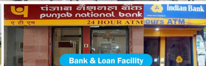
Bank & Loan Facility