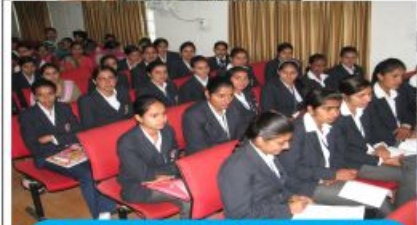
Communication Lab & Conference Hall (Personality & Skill Development.)