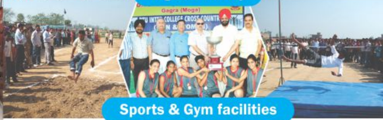
Sports & Gym facilities