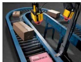
Fixed Position Barcode Reading

Our range of collaborative robots are easy to select, extremely simple to configure and communicate with and quick to install and commission. In addition, because of their collaborative attributes they can work with and around humans without the need for expensive and obtrusive safety guarding.