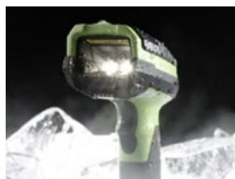
Handheld Barcode Reading