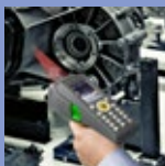
Automotive & Aerospace