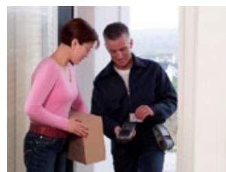
Mobile Computer & Printer Solutions