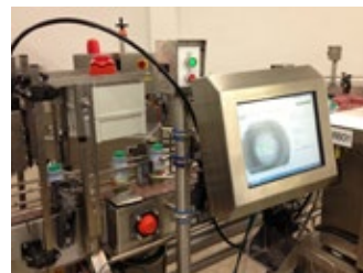
Food & Drink