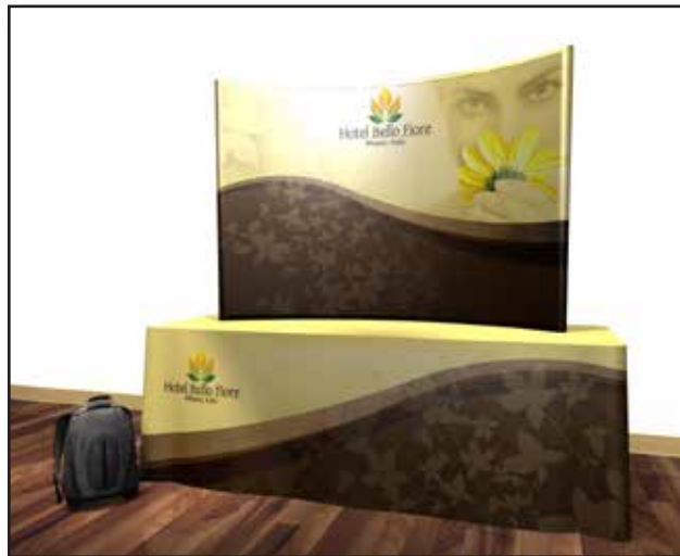
An entire tabletop unit – with inflator, battery, hose and 6' (2m) table throw – fits into a backpack and weighs less than 13 lbs. (5.9 kg).