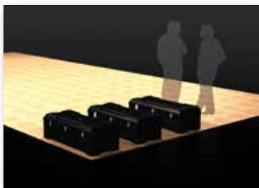
Hanging frames and vertical hardware pack into 3 hard cases that convert into functional counters.