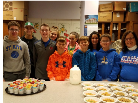
SCHOOL KIDS SERVE BREAKFAST Applause and appreciation to St. Rita's School Students for Life who gave up sleeping in on Columbus Day to serve breakfast to our guests.