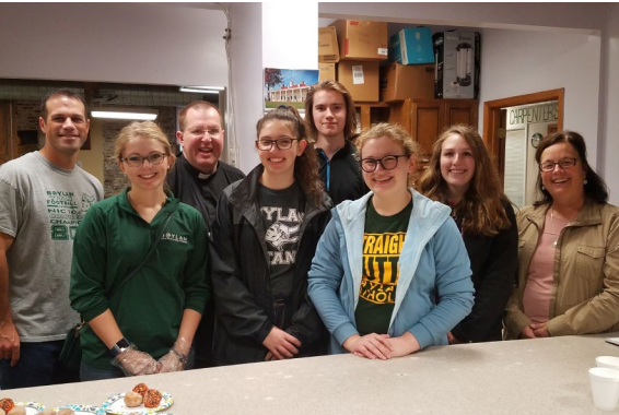
HIGH SCHOOL RETREAT Servant hearts are being nurtured at Boylan Catholic High School. Seniors provided breakfast to our guests as part of a one-day retreat.