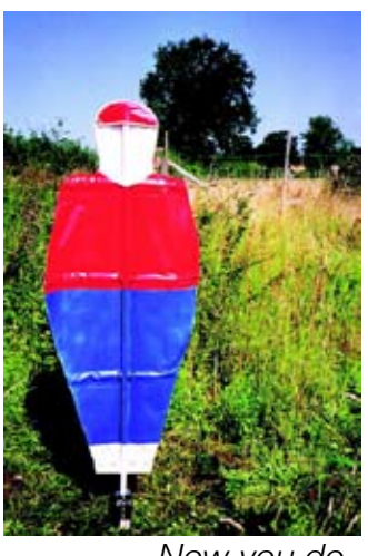
Now you do