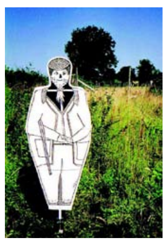
Now you see it