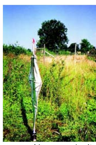
Now you don't