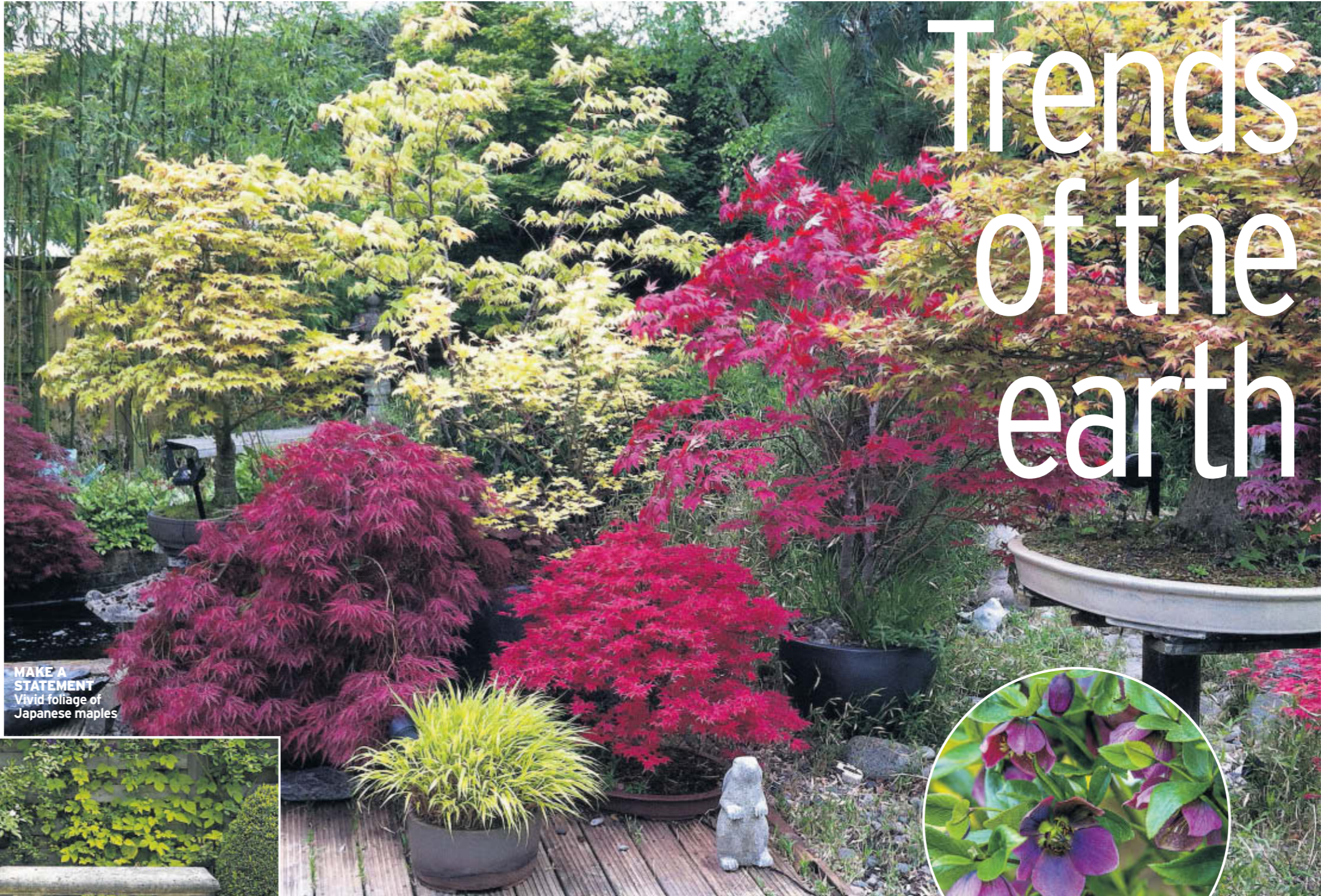
MAKE A STATEMENT Vivid foliage of Japanese maples

Trees such as mountain ash, birch and hawthorn are good for a small wooded area and are brilliant for birds if grown as a standard. Water newly