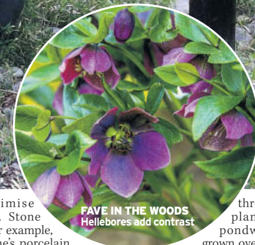
FAVE IN THE WOODS Hellebores add contrast

Many gardens at Chelsea this year will feature feats of engineering that turn technology into nature's ally. There will be garden swings that pump water