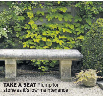
TAKE A SEAT Plump for stone as it's low-maintenance

planted trees regularly for the first two years to encourage deep roots to form. At this point - or now if you already have established trees - you can underplant with ferns, Digitalis (foxgloves), Helleborus (hellebores) and wildflowers. These will be picked