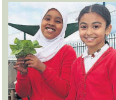
GROWING PLACES Star pupils

The great outdoors plays a huge part of modern-day schooling. From countryside locations to built-up urban estates, schools are looking for green-fingered activities and ways to create imaginative spaces for younger generations to enjoy.