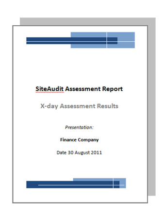
Integrated Audit Report