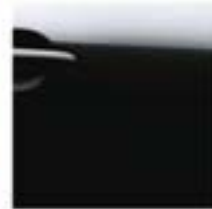
Garnet Black - M - GAC