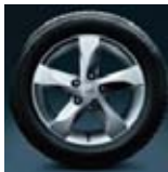
16" alloy wheels VISIA