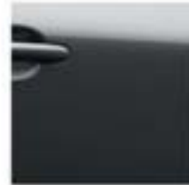
Gun Metallic - M - KAD