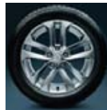
17" Sport alloy wheels ACENTA/ N-CONNECTA