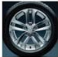
17" sport alloy wheel