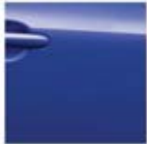
Ink Blue - M - RBN