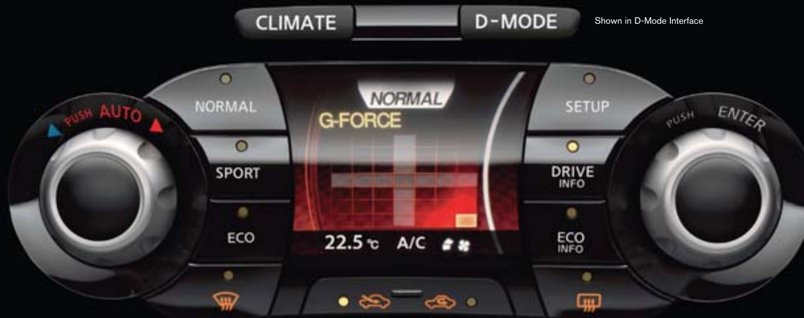
Shown in D-Mode Interface

Stats Keeper. Keep track of your performance stats through the Nissan Dynamic Control System drive computer. It stores information about everything from maximum G-forces to trip mileage and fuel economy. The more information you have, the smarter you'll drive.