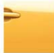
Sun Light Yellow - M - EAV