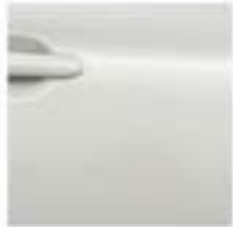
Storm White - P - QAB