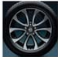
17" urban alloy wheel