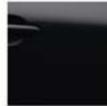
Pearl Black - M - Z11