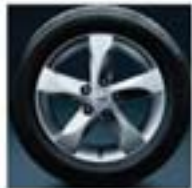
16" alloy wheel