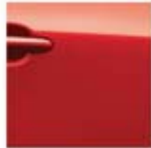
Flame Red - S - Z10