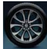
17" Urban alloy wheels TEKNA