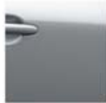
Blade Silver - M - KY0