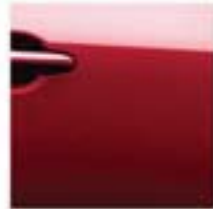
Magnetic Red - M - NAJ