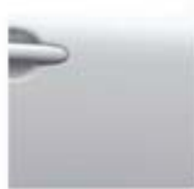
Artic White - S - 326