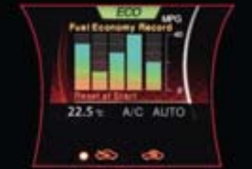
Shown in Climate Interface