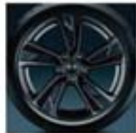
18" alloy - with personalisation