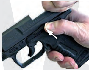
3.2.4. Fig. 1

To lock the slide in the open position, allow the slide to move slightly forward from the rearmost position while pressing upward on the slide stop (3.2.4. Fig. 1).