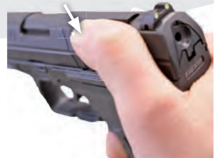
4.3. Fig. 1

Press the decocker downwards into the slide until the striker is audibly and visually de-cocked (4.3. Fig. 1). If you find that it is difficult or cumbersome to manipulate the decocker using your shooting hand's thumb, or if you are left-handed, you should use the thumb of your non-shooting hand to do so.