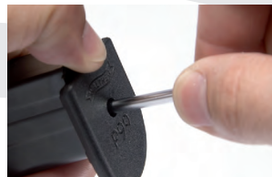
5.2.1. Fig. 1

Locate the metal tab at the rear base of the magazine. While the floorplate is fully seated to the rear of the magazine insert a flat bladed screwdriver in the slot of the metal tab and push the tab towards the top of the magazine until the tab protrudes from the base of the magazine (5.2.1. Fig. 2).