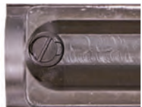
6.3. Fig. 2

Assembly is in reverse order (6.3. Fig. 2). Remember to make sure the screw and the thread inside the steel front sight are free of oil or grease. The thread of the front sight screw should be secured using an industrial adhesive (for example Loctite 648). To tighten the front sight screw, apply a torque of 8.8 inch lbs (1 Nm).