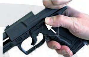
4.6. Fig. 3