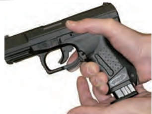
4.1. Fig. 1