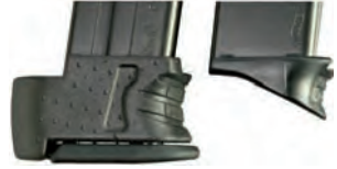
4.2.1. Fig. 1

With the proper adapter, Full Size magazines may be used on a P99 Compact. The adapter is an accessory item (4.2.1. Fig. 1). The adapter changes the grip of a Compact to a more comfortable one, and allows for a higher magazine capacity.