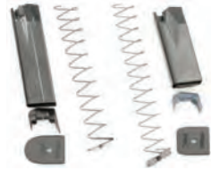
5.2.2. Fig. 1

Hold the tab flush with magazine body while sliding the floorplate on the tracks fully to the rear. Push the tab into the correct seating.