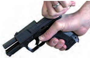
4.1. Fig. 2