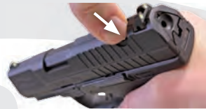
5.1.1. Fig. 1