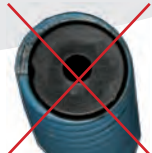
5.1.2. Fig. 4