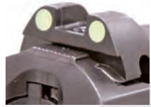
6.3. Fig. 2

Windage adjustments are made by drifting the steel rear sight (6.3. Fig. 2) from side to side with the rear sight adjustment tool. If shots group to the right, move the rear sight to the left, if they group to the left, move the rear sight to the right.