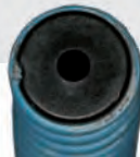
5.1.2. Fig. 3