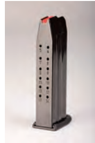
3.2.5. Fig. 1

When the magazine is removed from the magazine well in the grip, the number of rounds can be seen in the witness holes (3.2.5. Fig. 1). For Full Size Pistols +2 Magazines are available as an accessory item. They hold an additional 2 rounds and provide a downward extension to the pistol's grip.