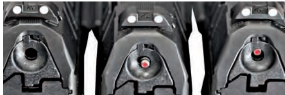
3.2.2. Fig. 1, from left to right: de-cocked, cocked, cocked (P99 QA only)