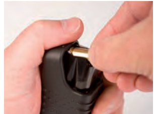
4.2.1. Fig. 4