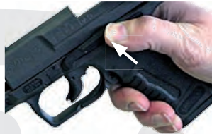
4.1. Fig. 3