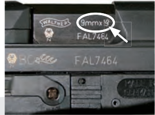
2. Fig. 1

Locate the cartridge designation marked on the handgun. This information indicates the ammunition that must be used in this firearm (see 2. Fig. 1). You are responsible for selecting ammunition that meets industry standards and is appropriate in type and caliber for this firearm.