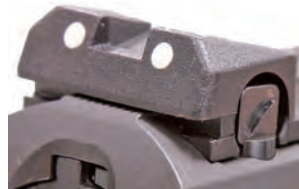
6.3. Fig. 1

Adjustment by one click moves the impact point approximately .7" (2 cm) at a distance of 25 yards (25 m) (6.3. Fig. 1).