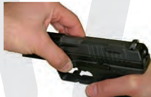
5.1.1. Fig. 2