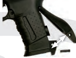
6.1. Fig. 1

The P99 Full Size pistol backstraps are offered in sizes Small, Medium, and Large. The P99 Compact comes with backstraps in sizes Small and Large.