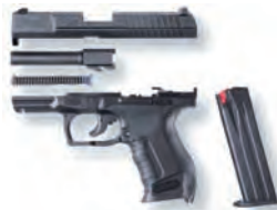
5.1.1. Fig. 4