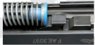
5.1.2. Fig. 2