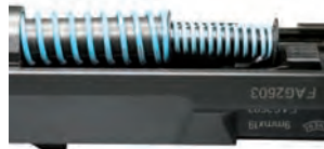
5.1.2. Fig. 5, P99 C

Note: It is normal for the recoil guide rod to slightly protrude from the Full Size 9mm slide.