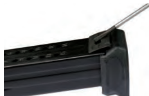
5.2.1. Fig. 2

Push the magazine floorplate towards the front of the magazine while retaining the magazine floorplate catch and spring with your thumb.