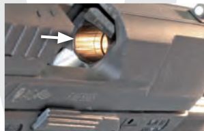
4.1. Fig. 4