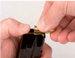
4.2.1. Fig. 2

Loading may be made easier with the aid of the WALTHER Magazine Loader: Put the magazine loader with its long wall oriented to the rear on top of the magazine (4.2.1. Fig. 3). Press down the magazine loader and insert a cartridge with your other hand (4.2.1. Fig. 4). Let the magazine loader go up again. Push in the cartridge completely with your hand. Repeat the procedure for the number of cartridges you wish to load, up to the magazine capacity.