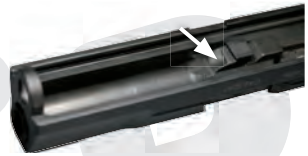
5.1.2. Fig. 1

Place the large spring end of the recoil rod into the spring mounting at the front of the slide, and then insert the other end of the recoil guide rod assembly into the lower barrel recess, while compressing the spring (5.1.2. Fig. 2 and 5).