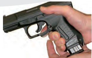
4.6. Fig. 1