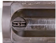
6.3. Fig. 1

Unscrew the front sight screw with the 1.3 mm Allen wrench from the bottom of the front sight. Push the front sight out of the slide. Assembly is in reverse order. Screw in the front sight screw until it is flush with the base of the front sight (6.3. Fig. 1).