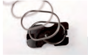
5.2.2. Fig. 2