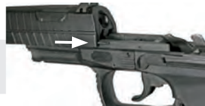
5.1.2. Fig. 6