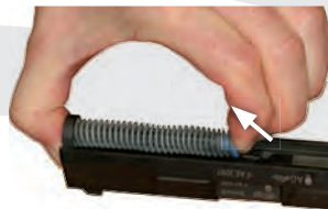
5.1.1. Fig. 3