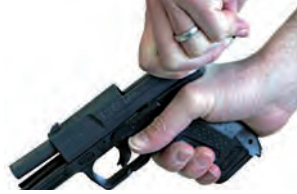
4.6. Fig. 2

Grasp the serrated sides of the slide from the rear with the thumb and fingers (4.6. Fig. 2), and briskly draw the slide fully rearward in order to extract any cartridge from the chamber and clear it from the pistol. Do not obstruct the ejection port because doing so can interfere with proper ejection of a cartridge.