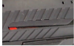
3.2.1. Fig. 1

The loaded chamber indicator can be observed when the rear of the extractor is recessed, revealing a red colored marking (3.2.1. Fig. 1).