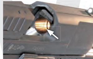
4.6. Fig. 4