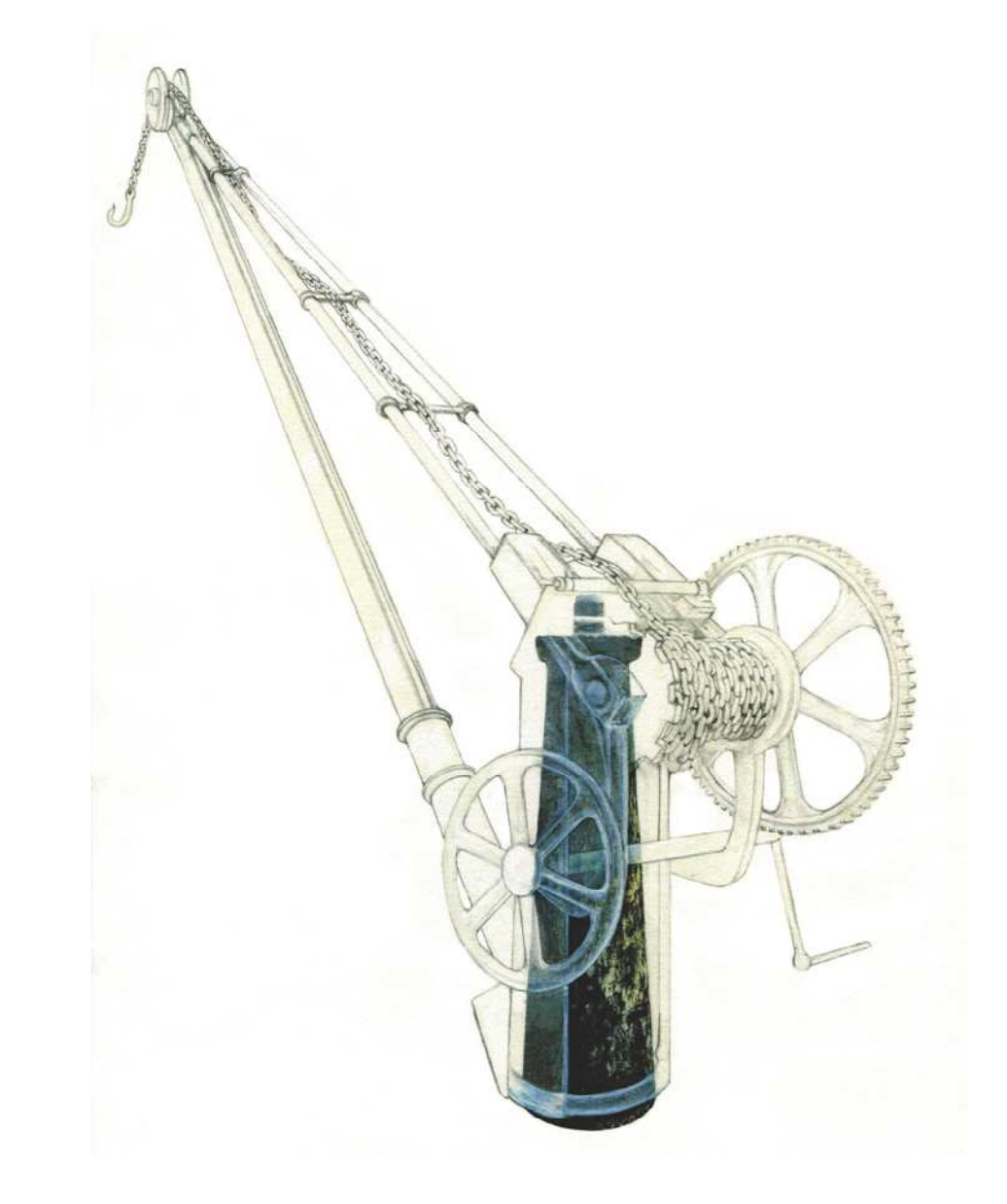
Illustration by Sandra Doyle

Can you add to the picture to show the crane in use?